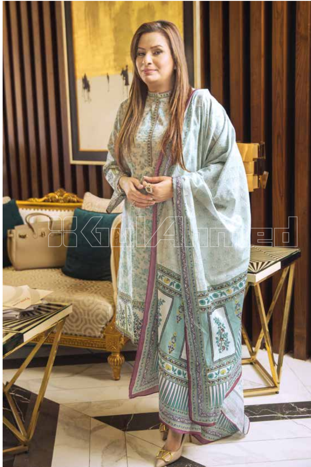
CL704A Printed Dupatta. Printed Shirt. Dyed Trouser.