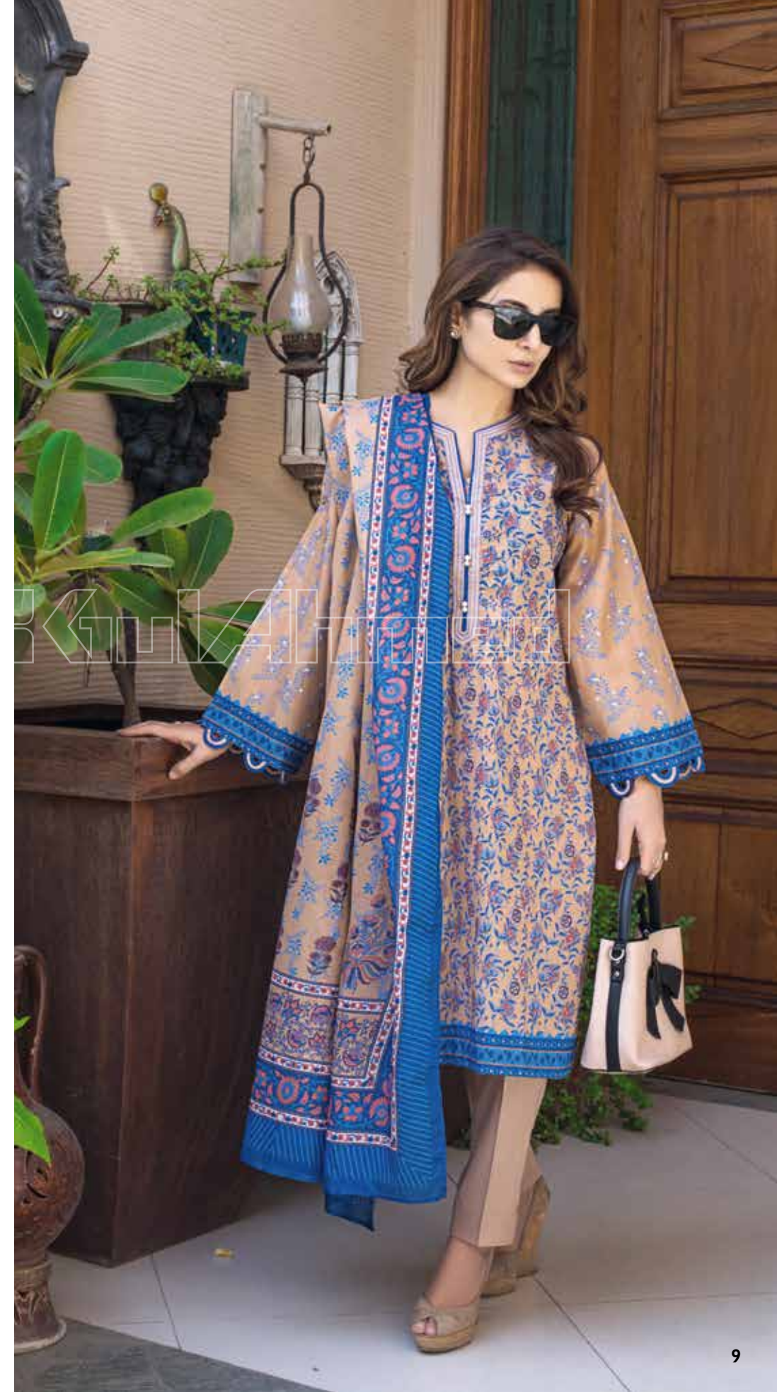
CL705A Printed Dupatta. Printed Shirt. Dyed Trouser.