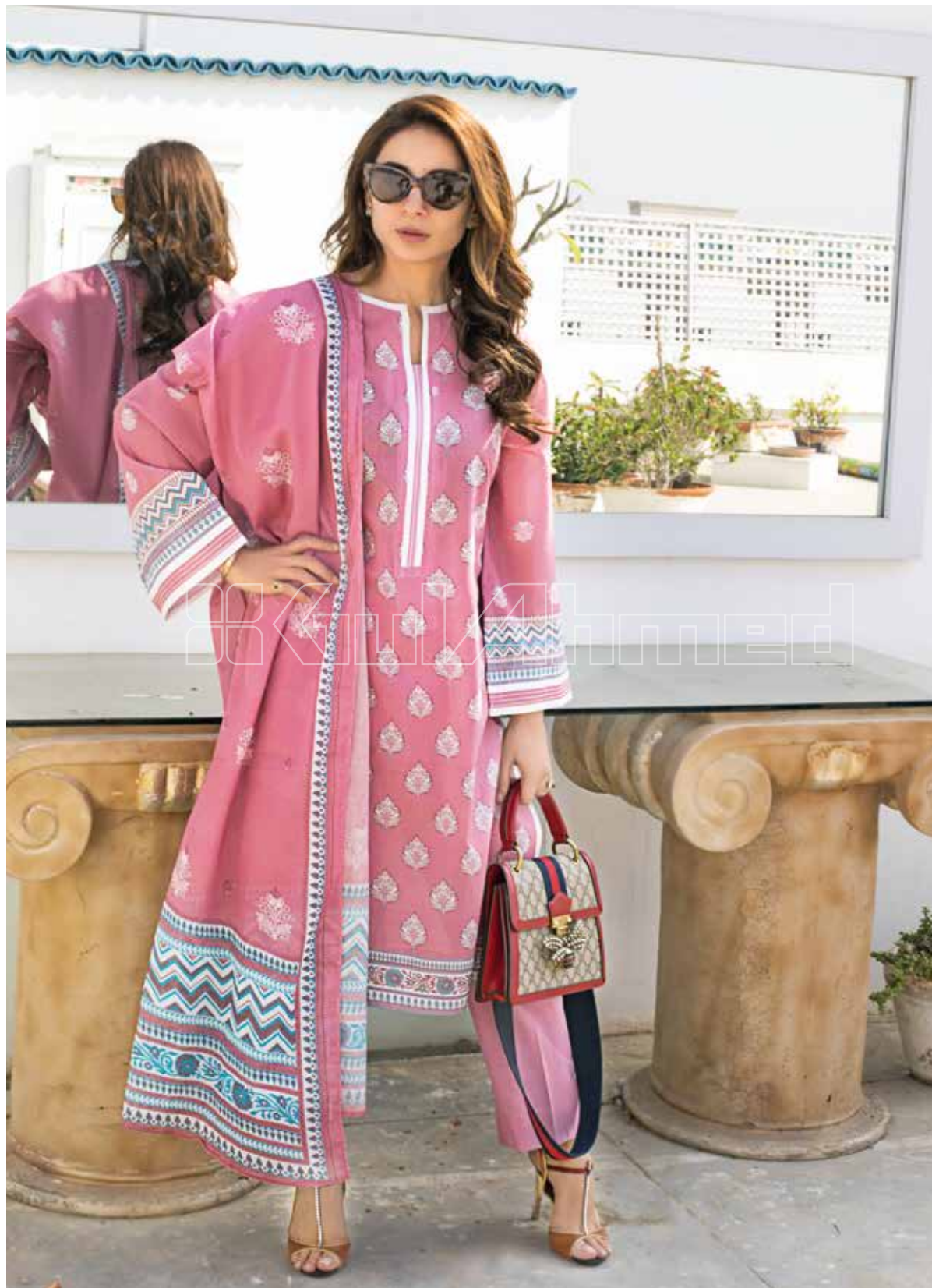
CL663A Printed Dupatta. Printed Shirt. Dyed Trouser.