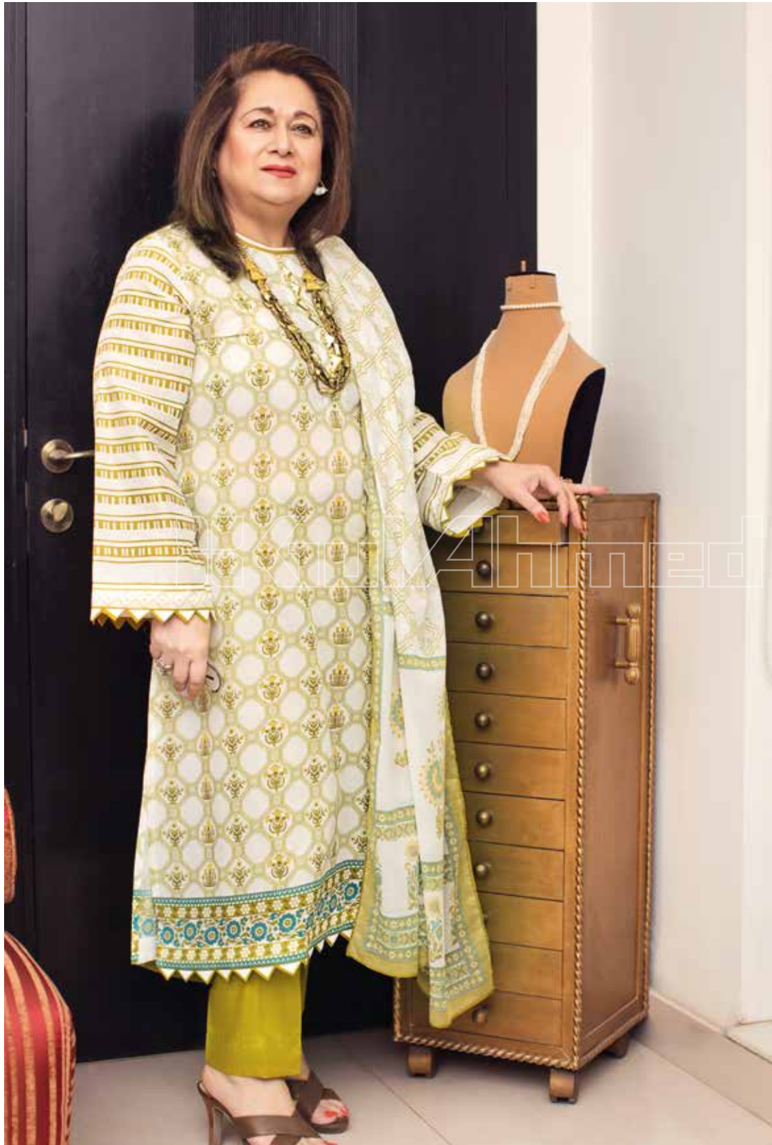
CL664B Printed Dupatta. Printed Shirt. Dyed Trouser.