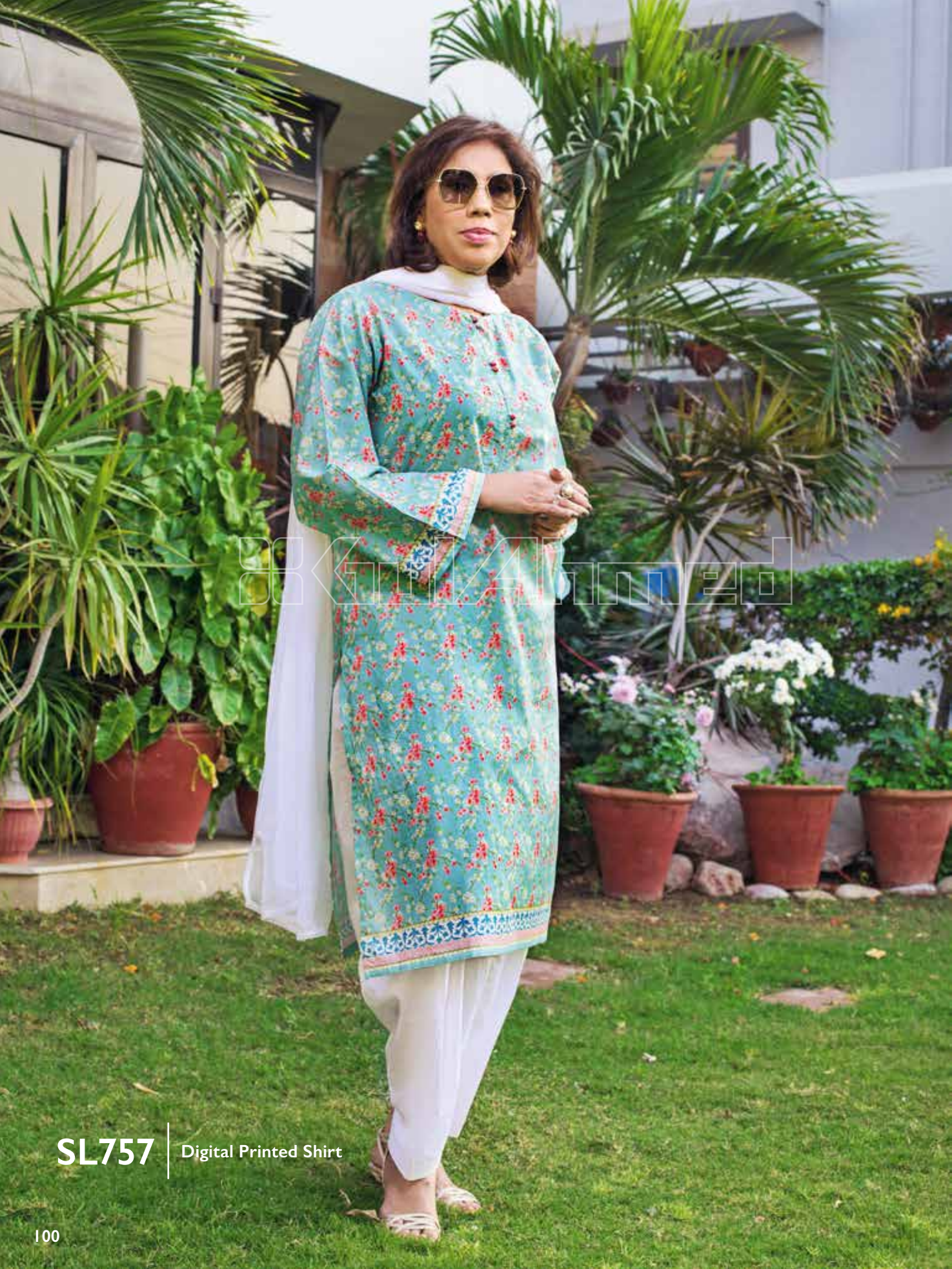
SL757 | Digital Printed Shirt