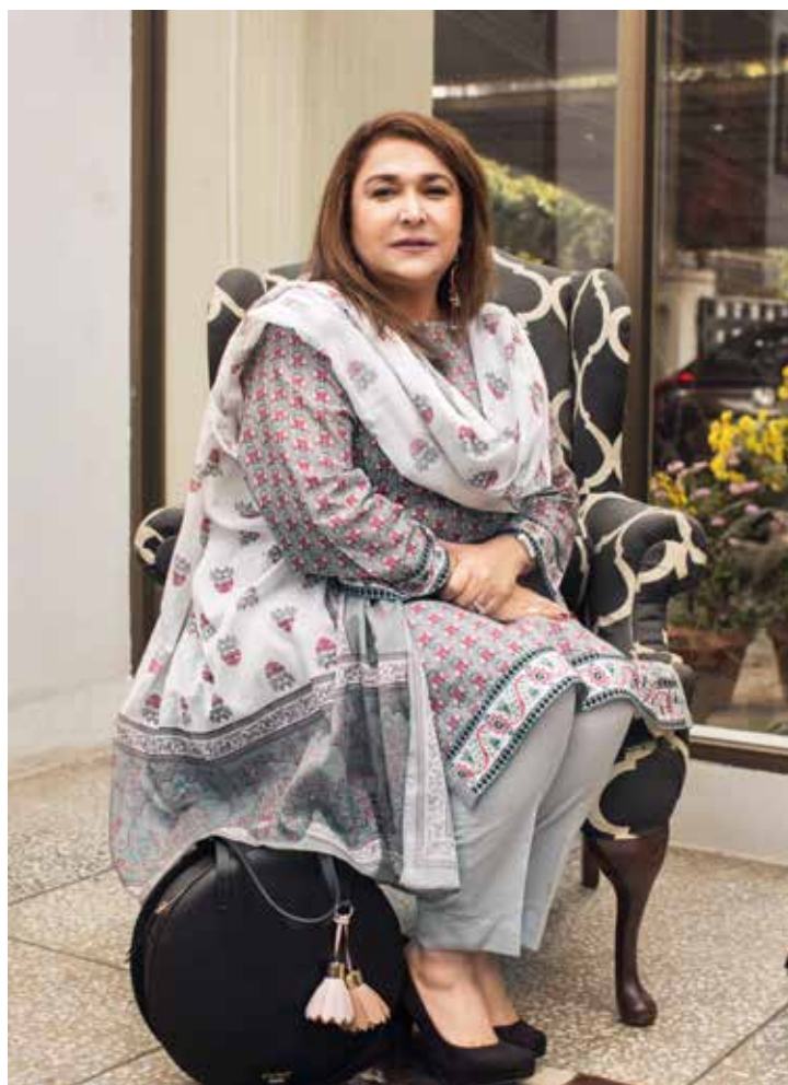
CL648A Printed Dupatta. Printed Shirt. Dyed Trousers.