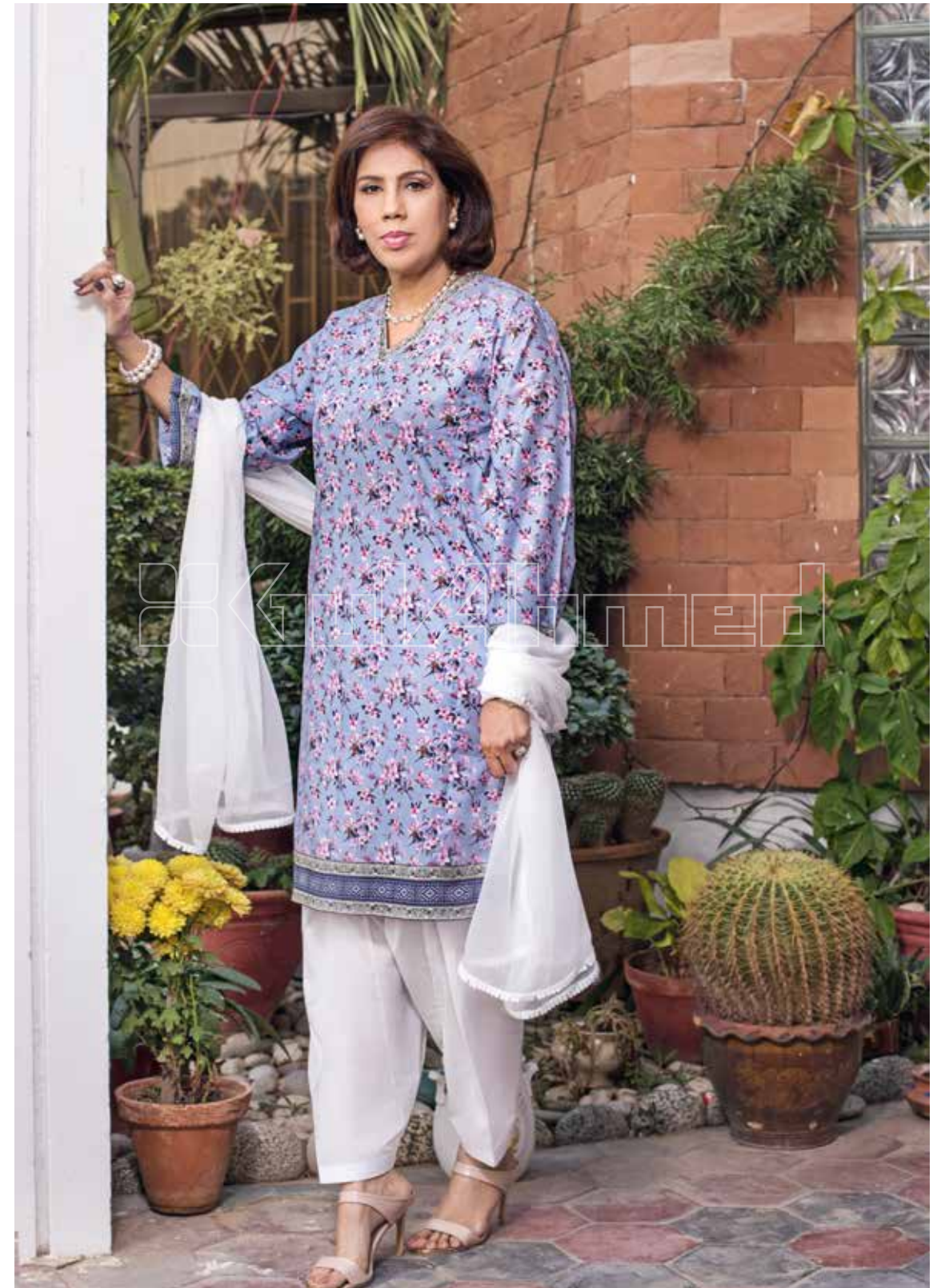
SL756 | Digital Printed Shirt