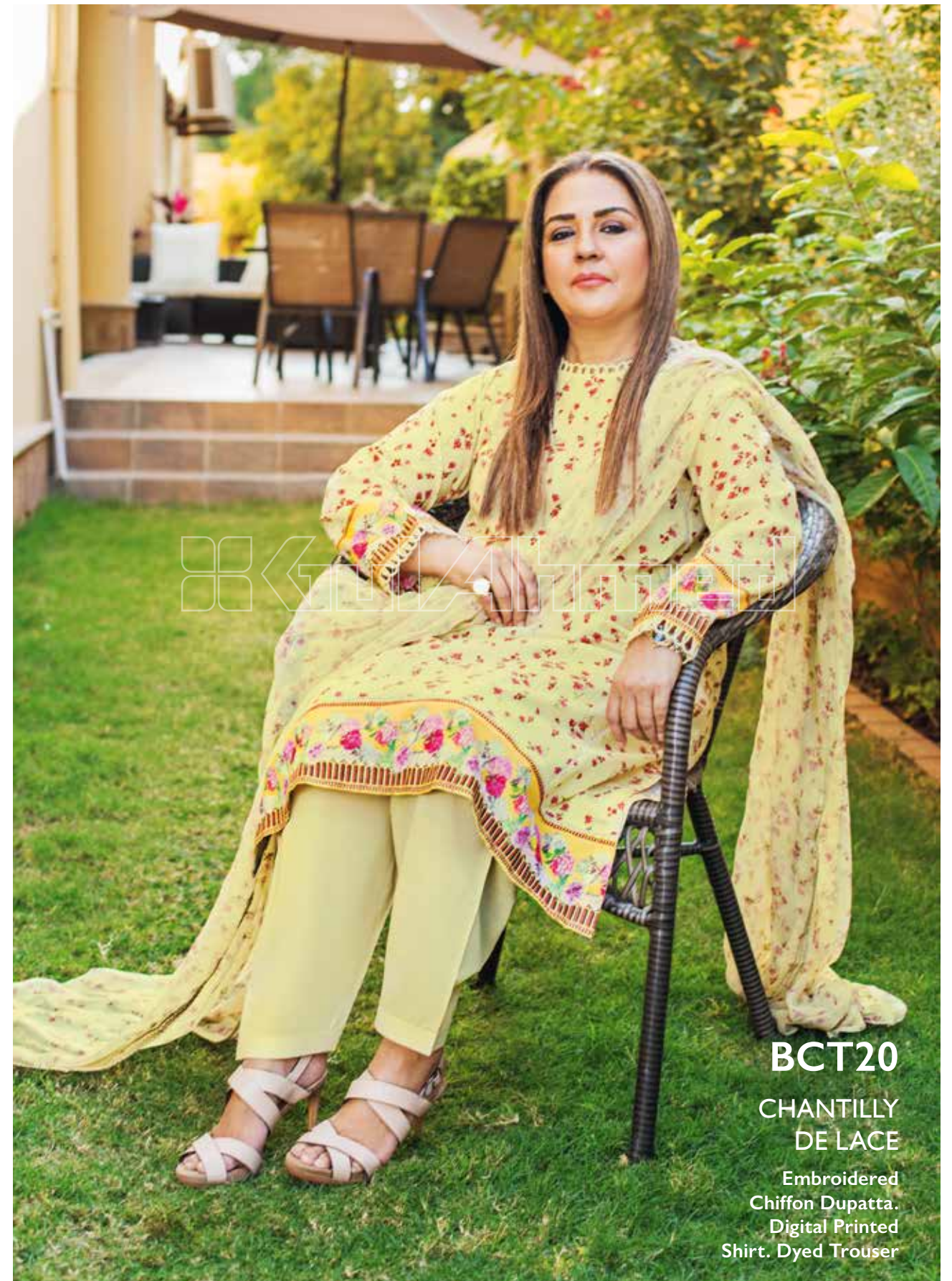
BCT20 CHANTILLY DE LACE Embroidered Chiffon Dupatta. Digital Printed Shirt. Dyed Trouser