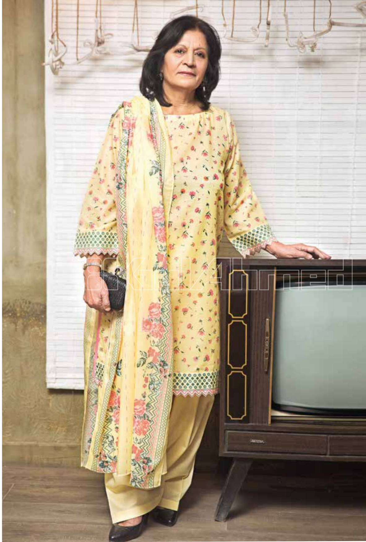
CL666B Printed Dupatta. Printed Shirt. Dyed Trouser.