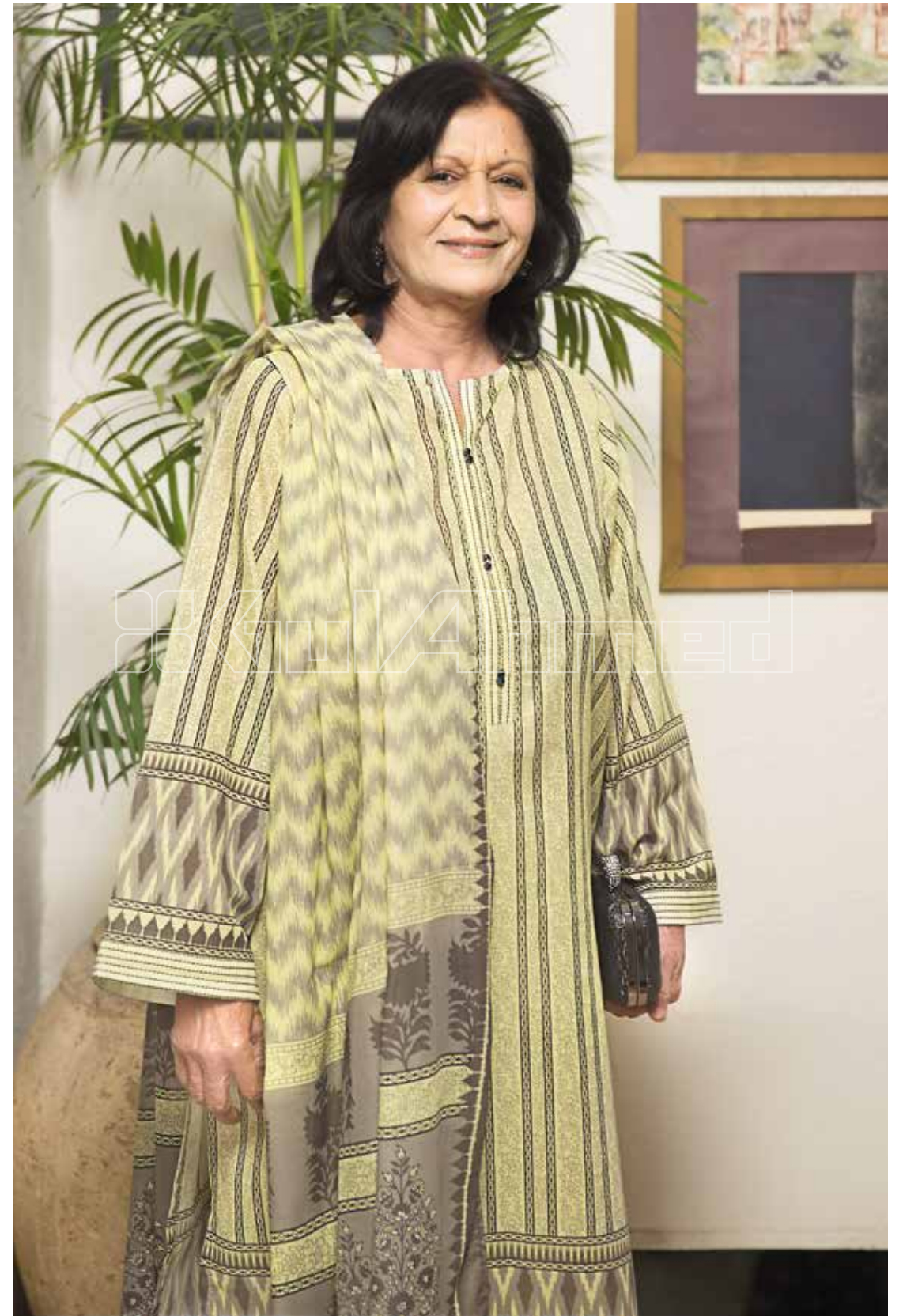
CL671B Printed Dupatta. Printed Shirt. Dyed Trouser.