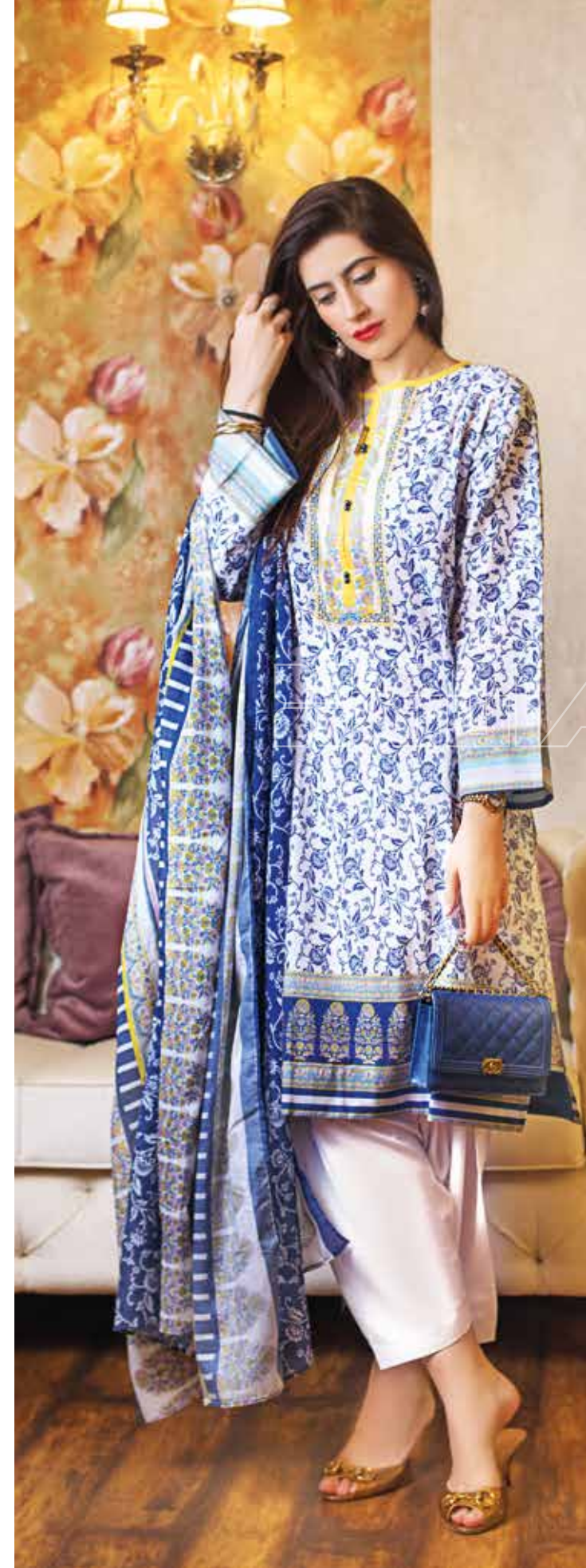
BASIC THREE PIECE LAWN