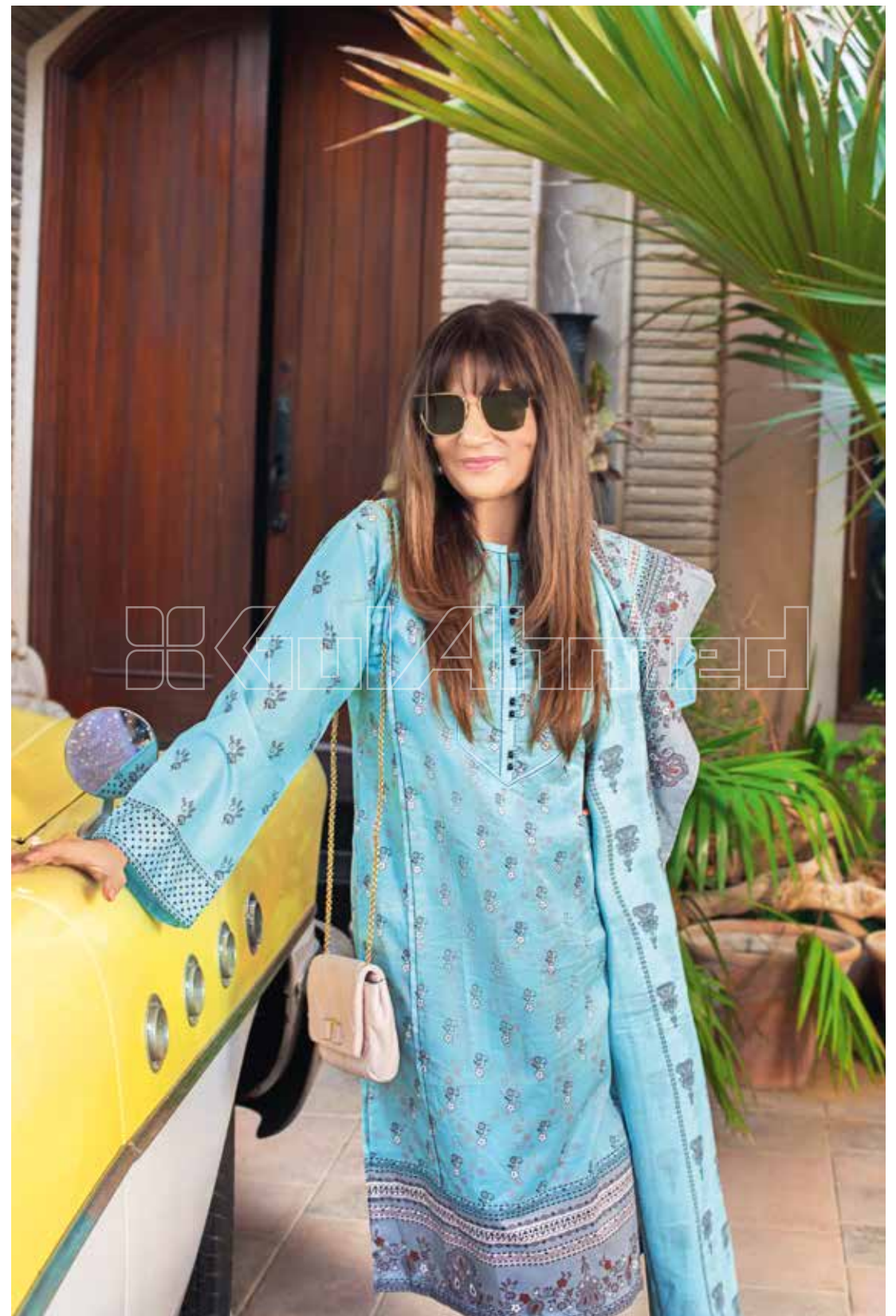
CL702B Printed Dupatta. Printed Shirt. Dyed Trouser.