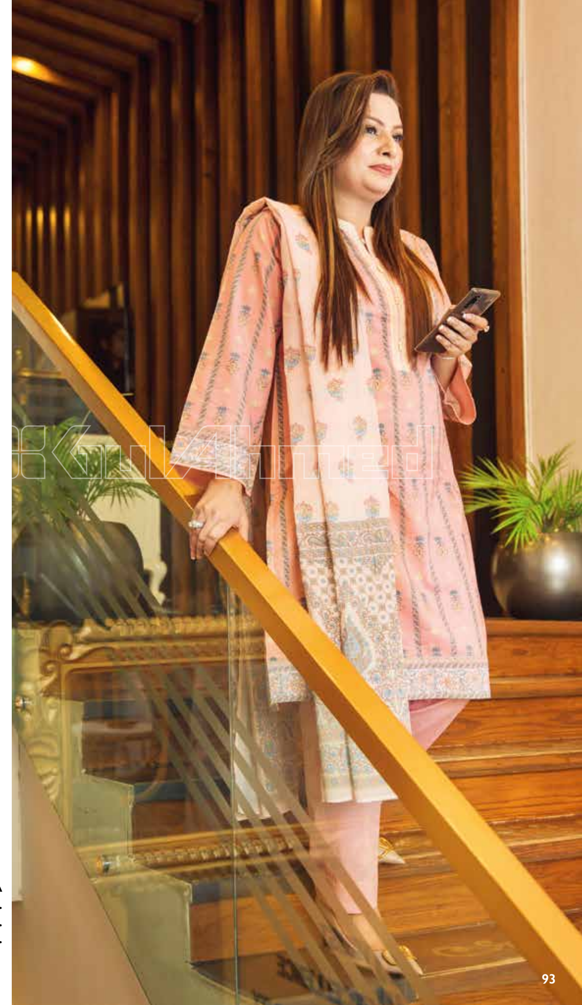
CL716A Printed Dupatta. Printed Shirt. Dyed Trouser.