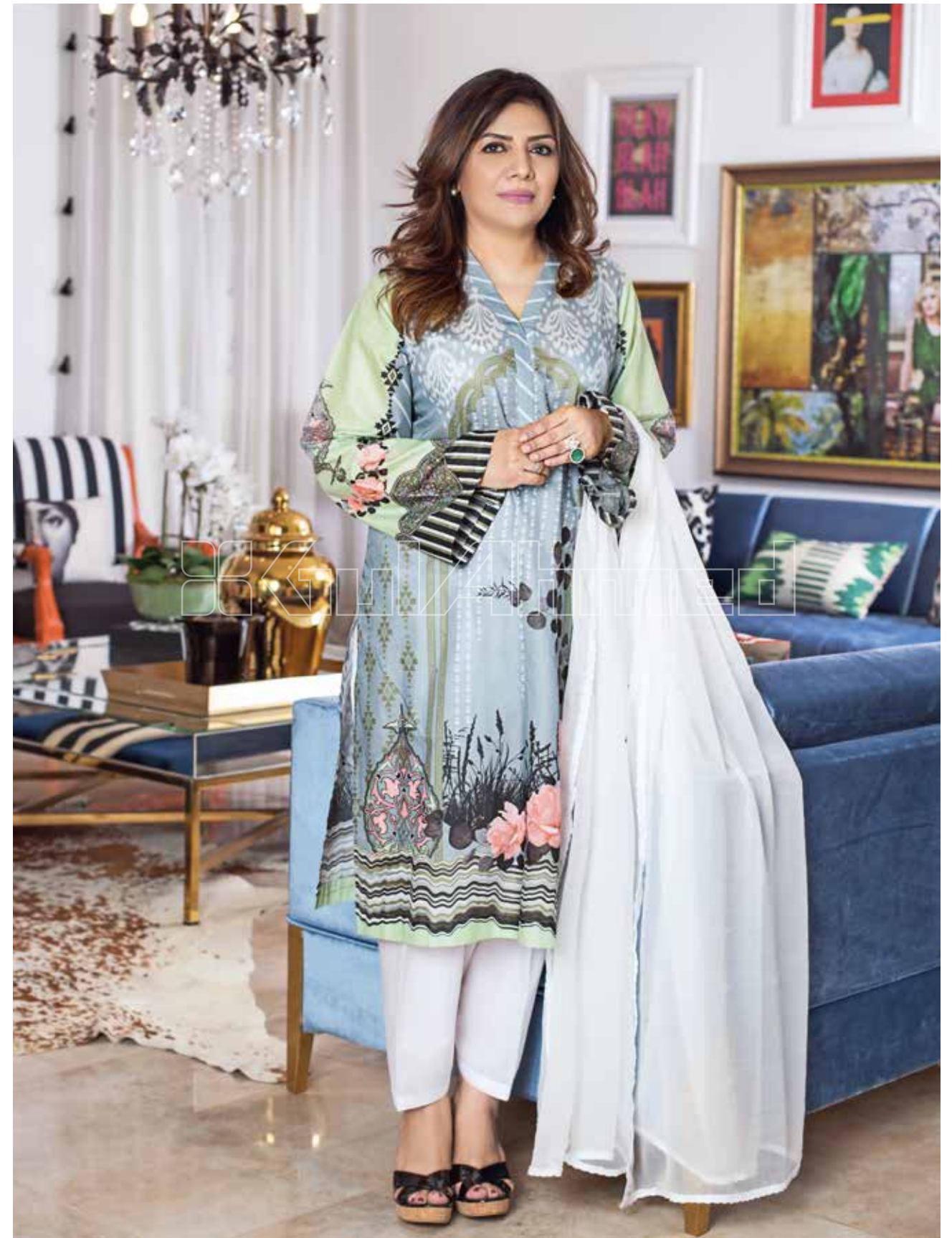
SL781 | Printed Shirt