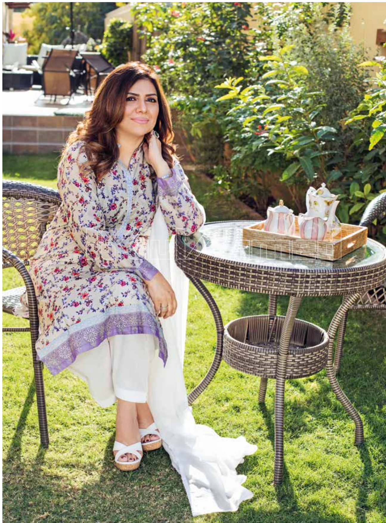
SL761 | Digital Printed Shirt