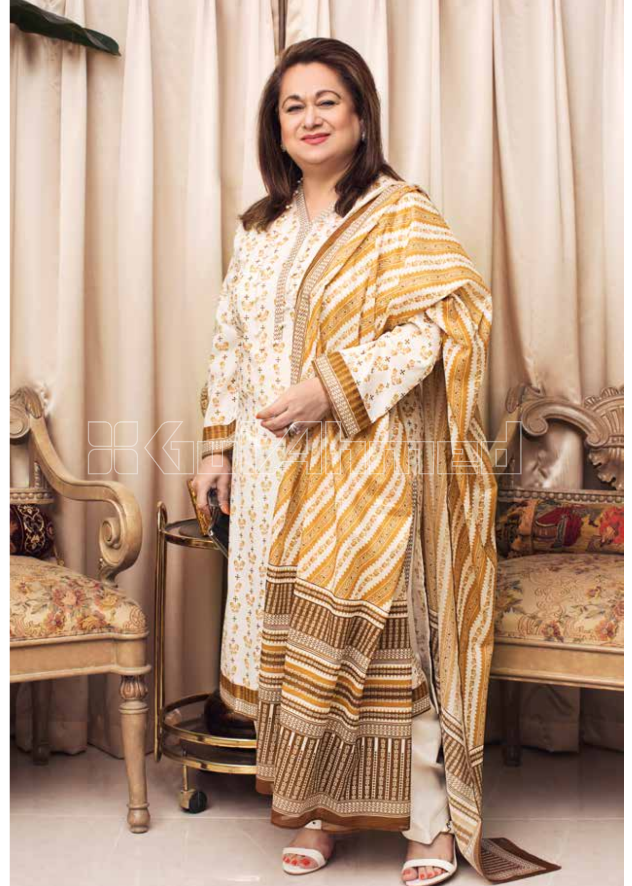
CL670A Printed Dupatta. Printed Shirt. Dyed Trouser.