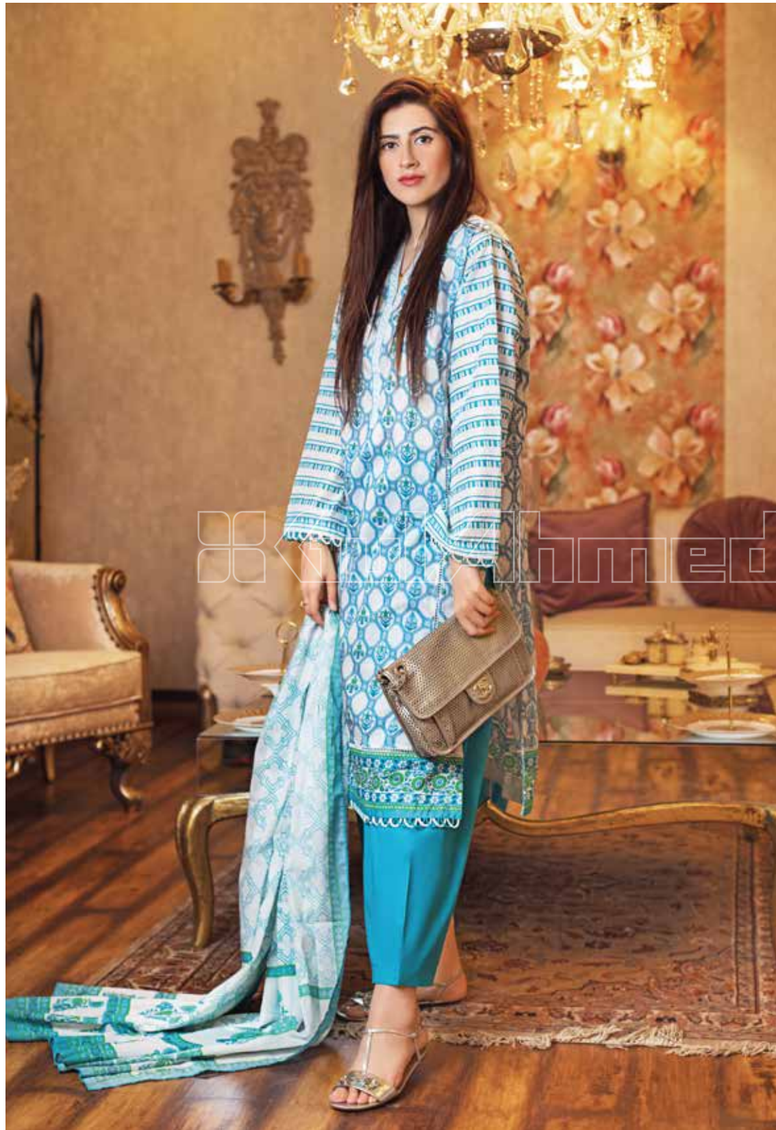
CL664A Printed Dupatta. Printed Shirt. Dyed Trouser.