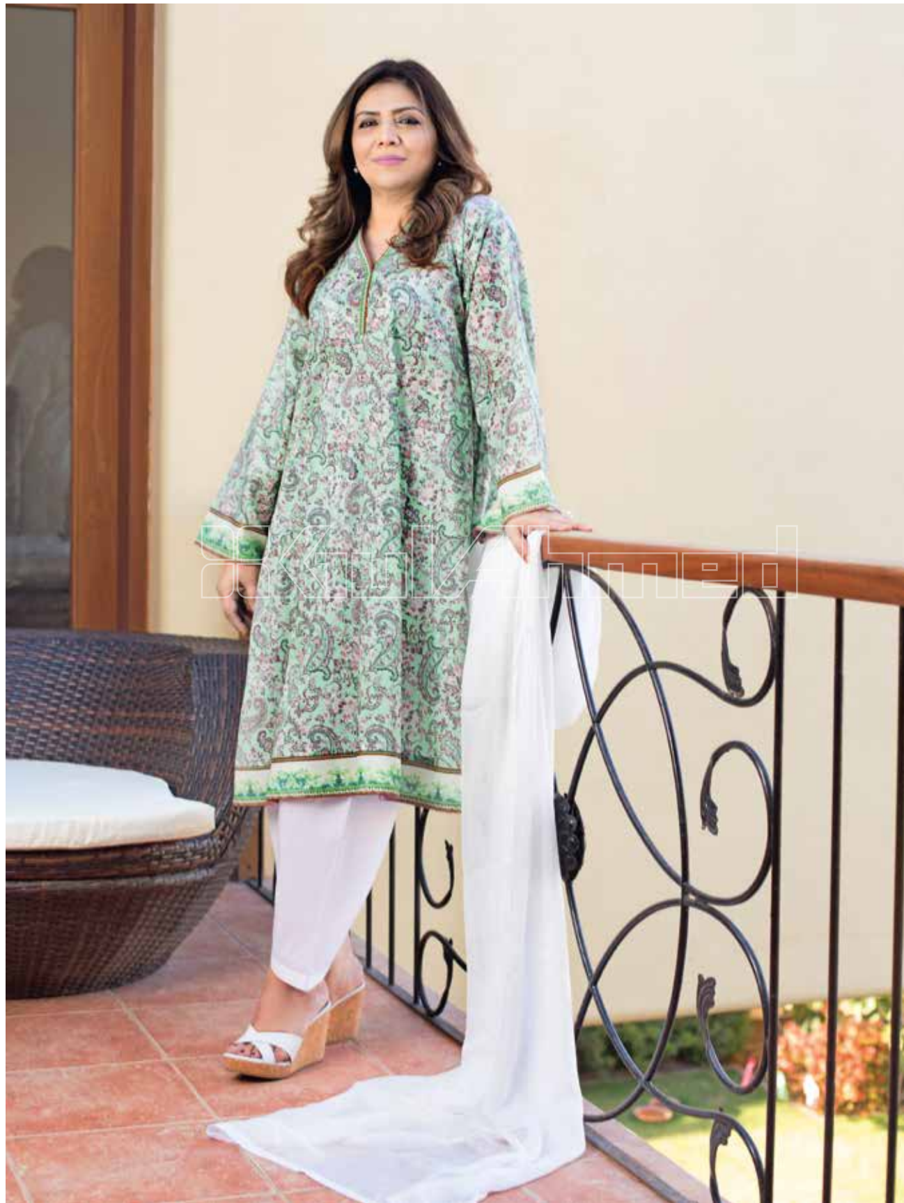
SL760 | Digital Printed Shirt