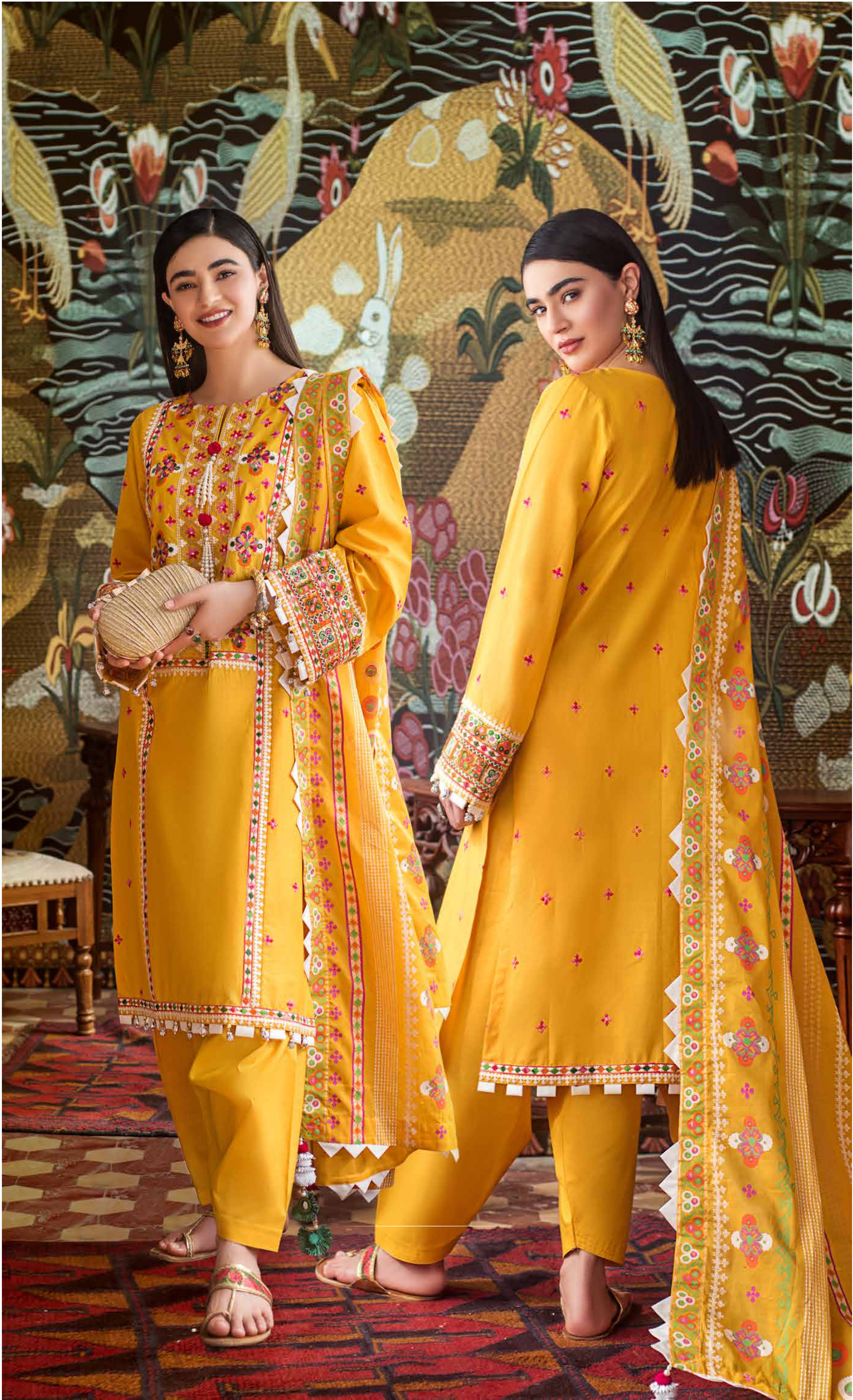
Lacquer Printed Lawn Dupatta. Embroidered Front & Side Panels with Zari. Embroidered Lace for Front. Dyed Lawn Back. Embroidered Sleeves with Zari. Dyed Trouser.