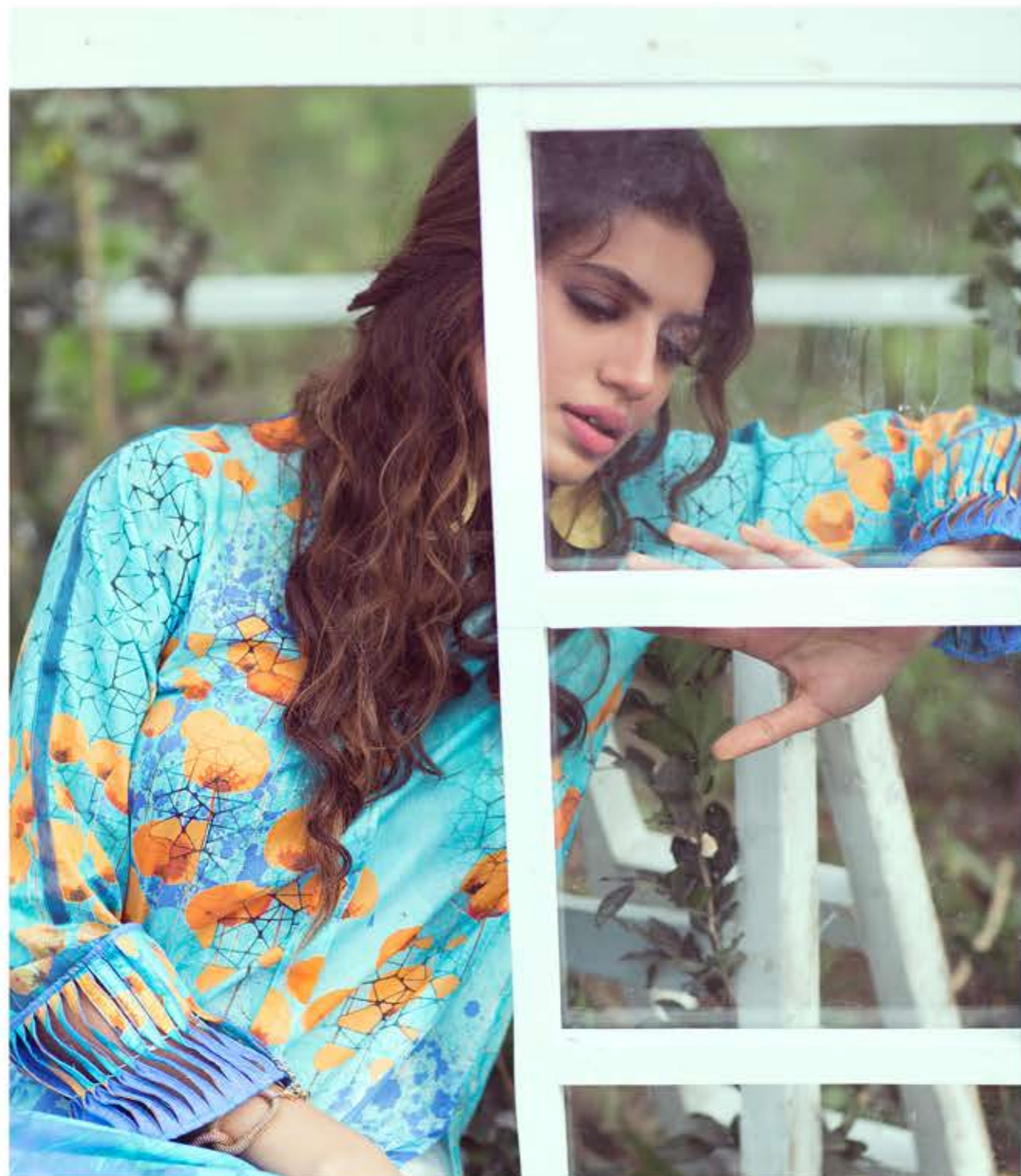
MUSING ON SPRING