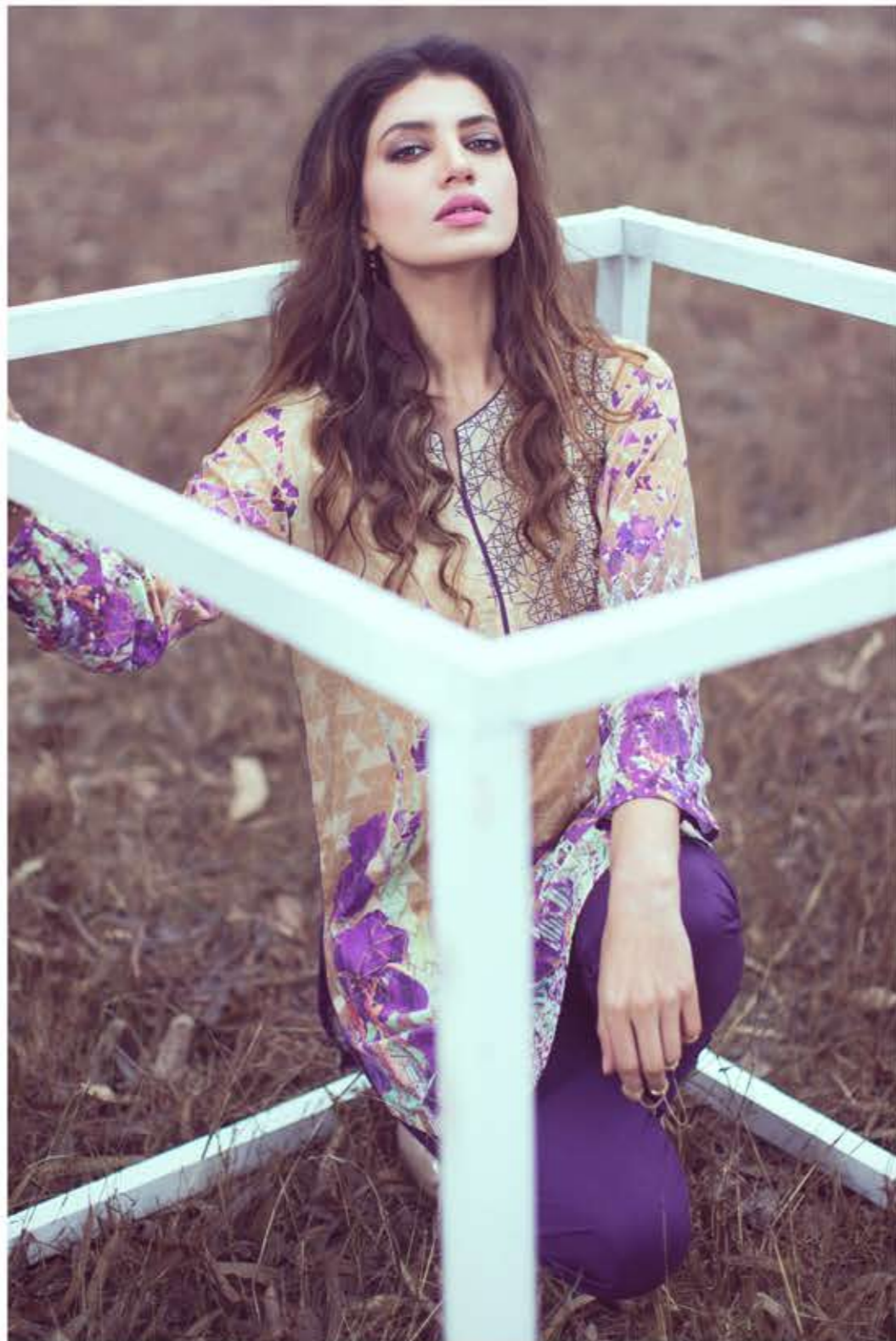
GETTING EDGY WITH FLORALS