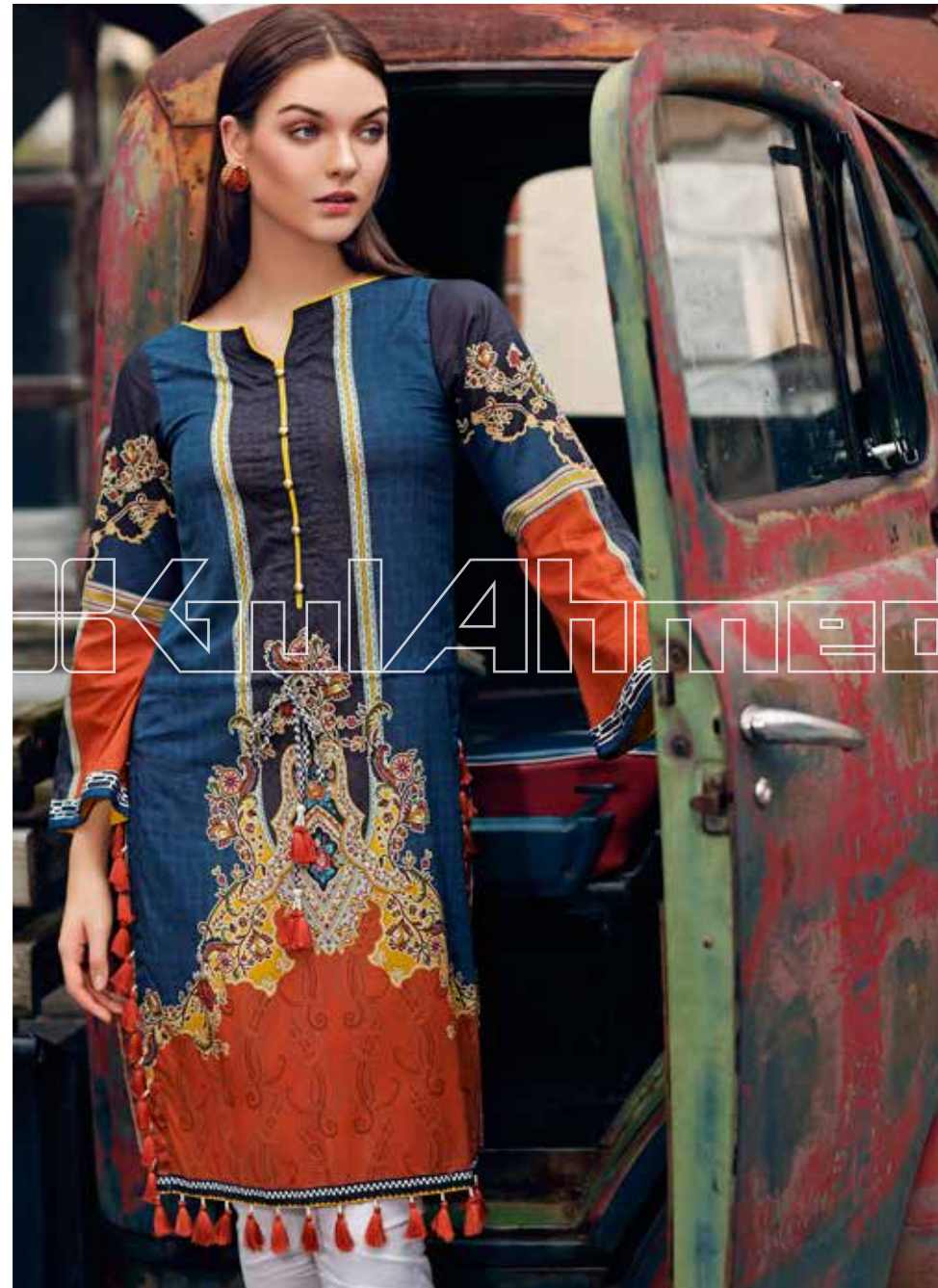
SL622 - DIGITAL PRINTED SHIRT

Also Available as stitched at selected ideas stores & online.