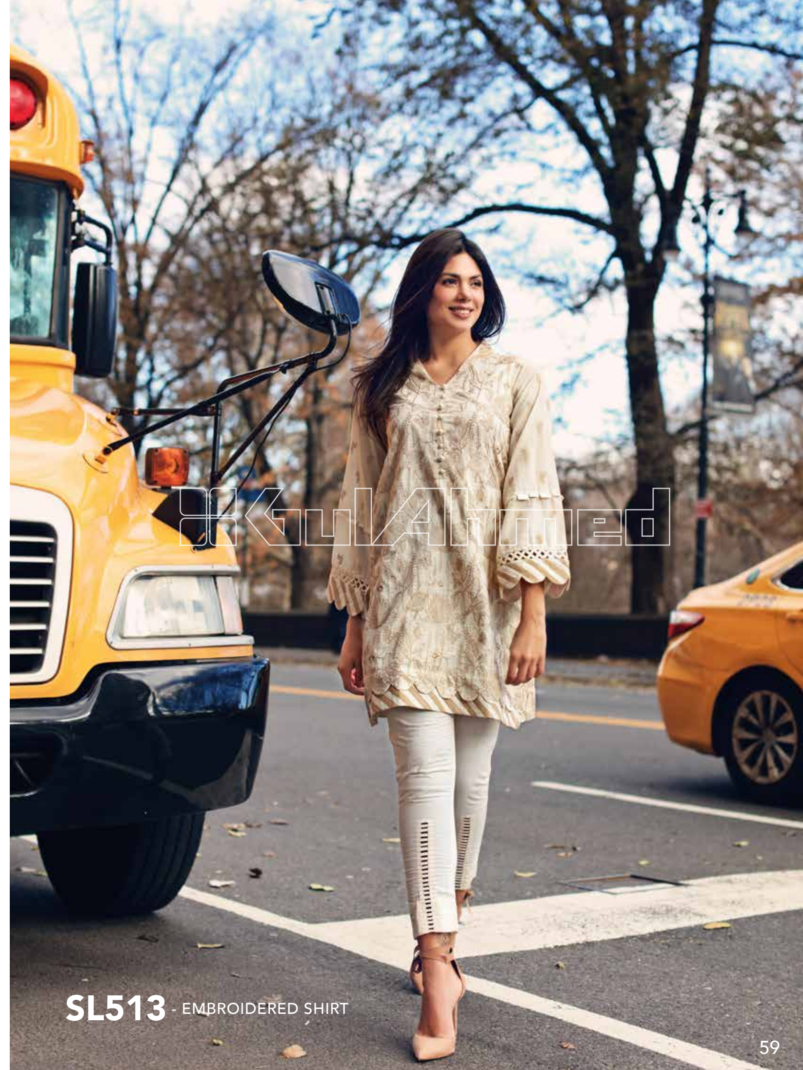
SL513 - EMBROIDERED SHIRT