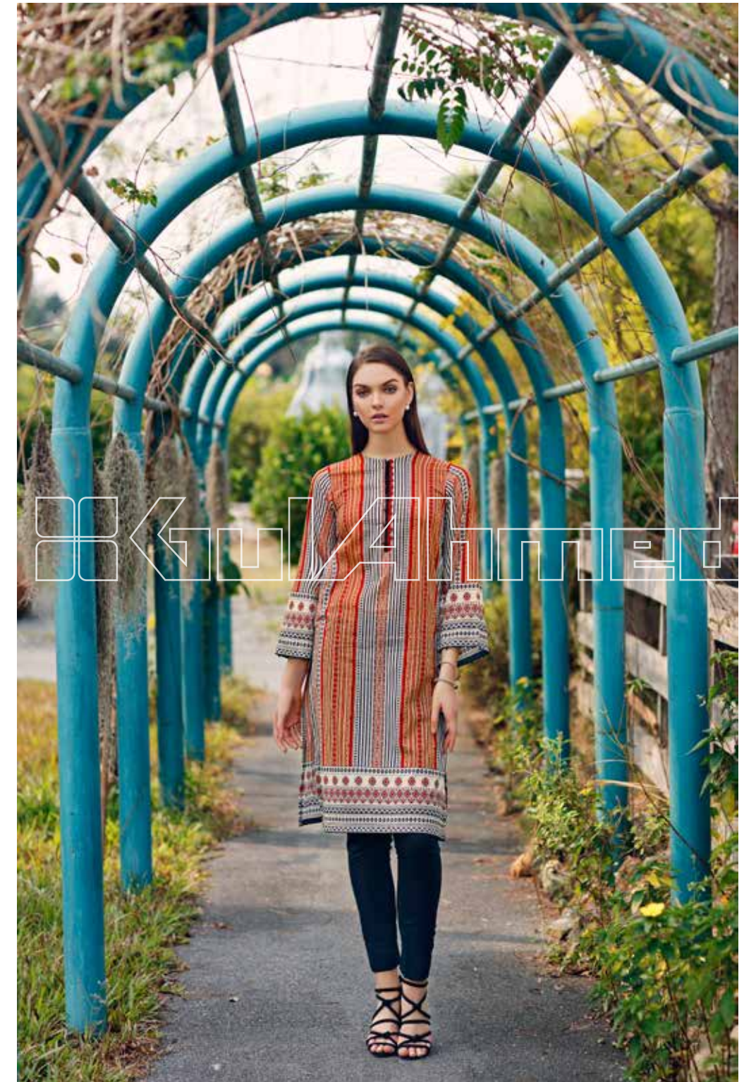
SL584 - DIGITAL PRINTED SHIRT