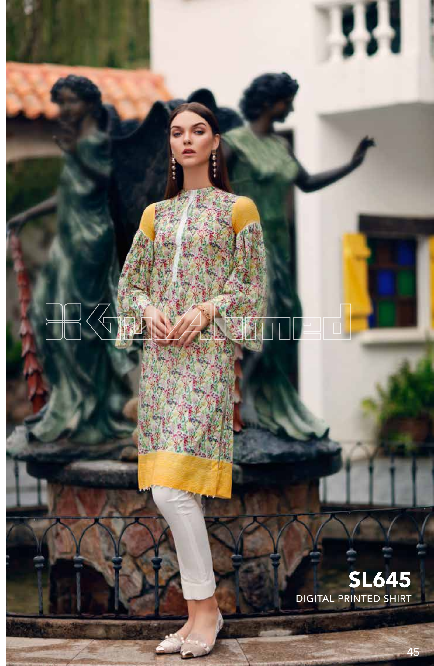
SL645 DIGITAL PRINTED SHIRT