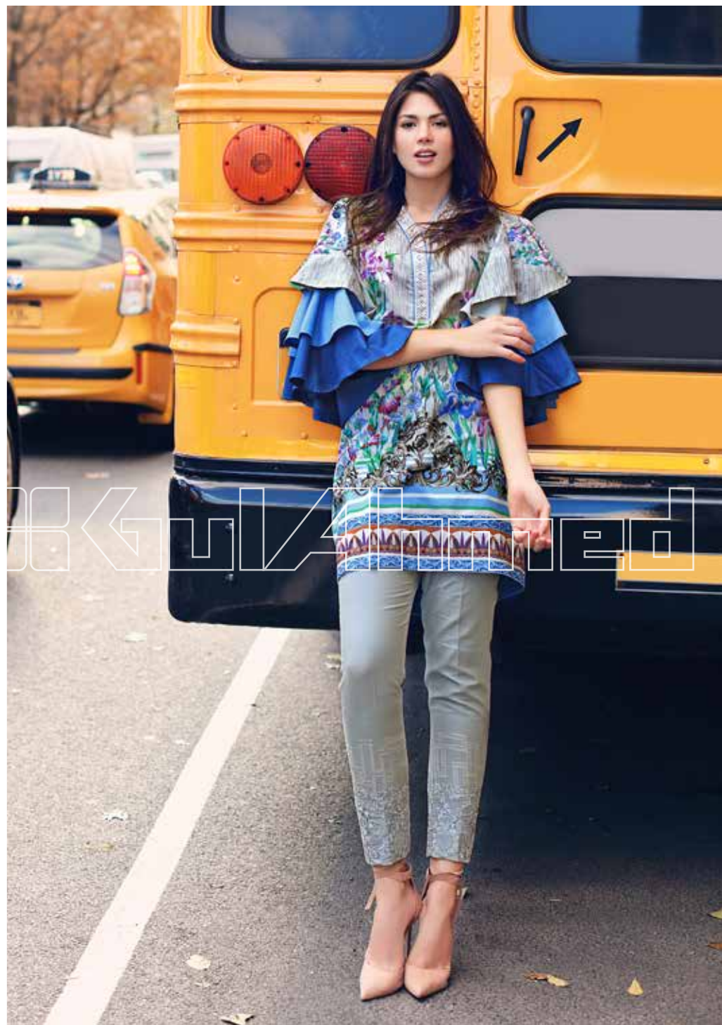
TL171B - DIGITAL PRINTED SHIRT WITH EMBROIDERED LACE & EMBROIDERED BOTTOM