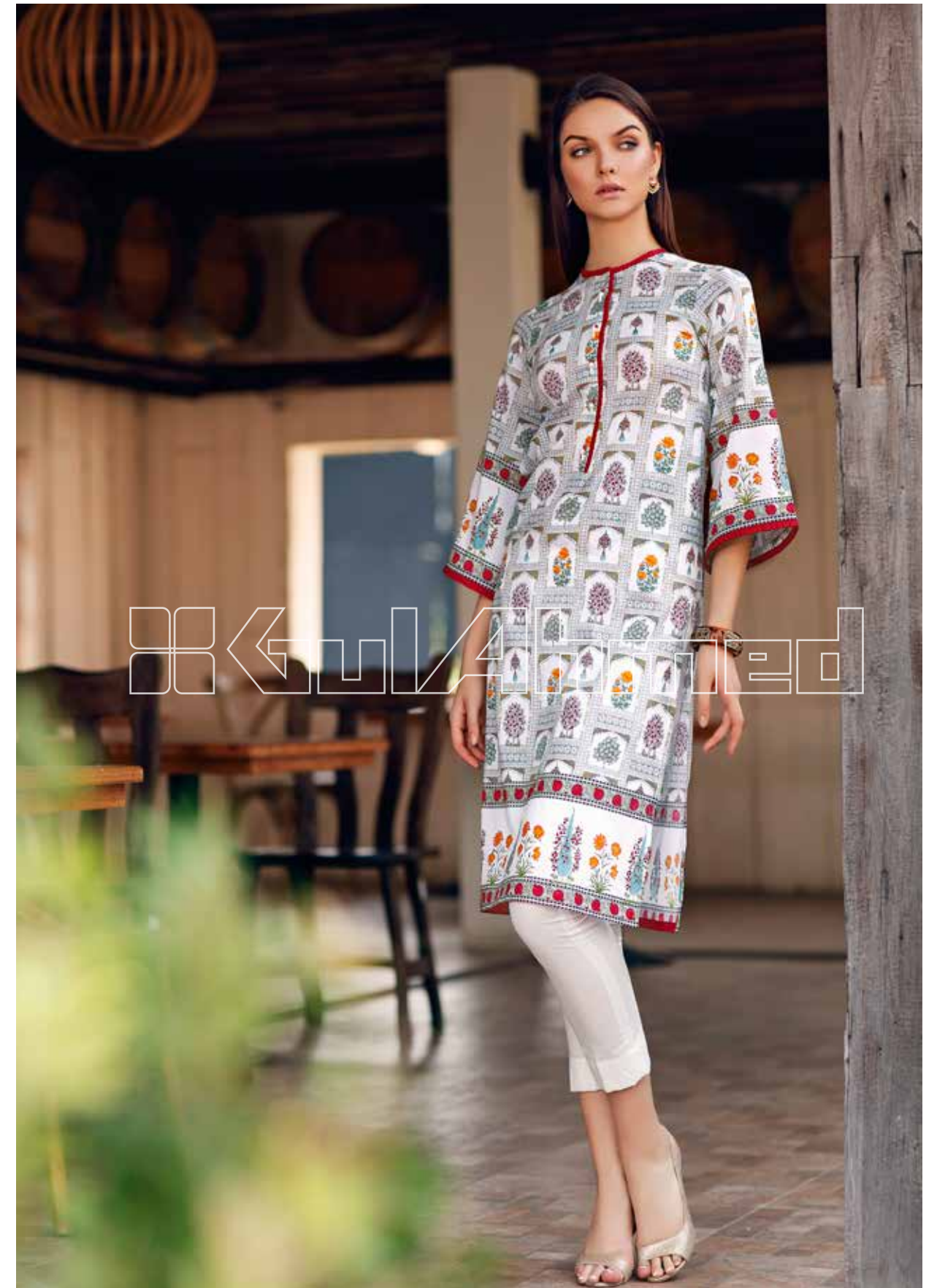
SL582 - DIGITAL PRINTED SHIRT