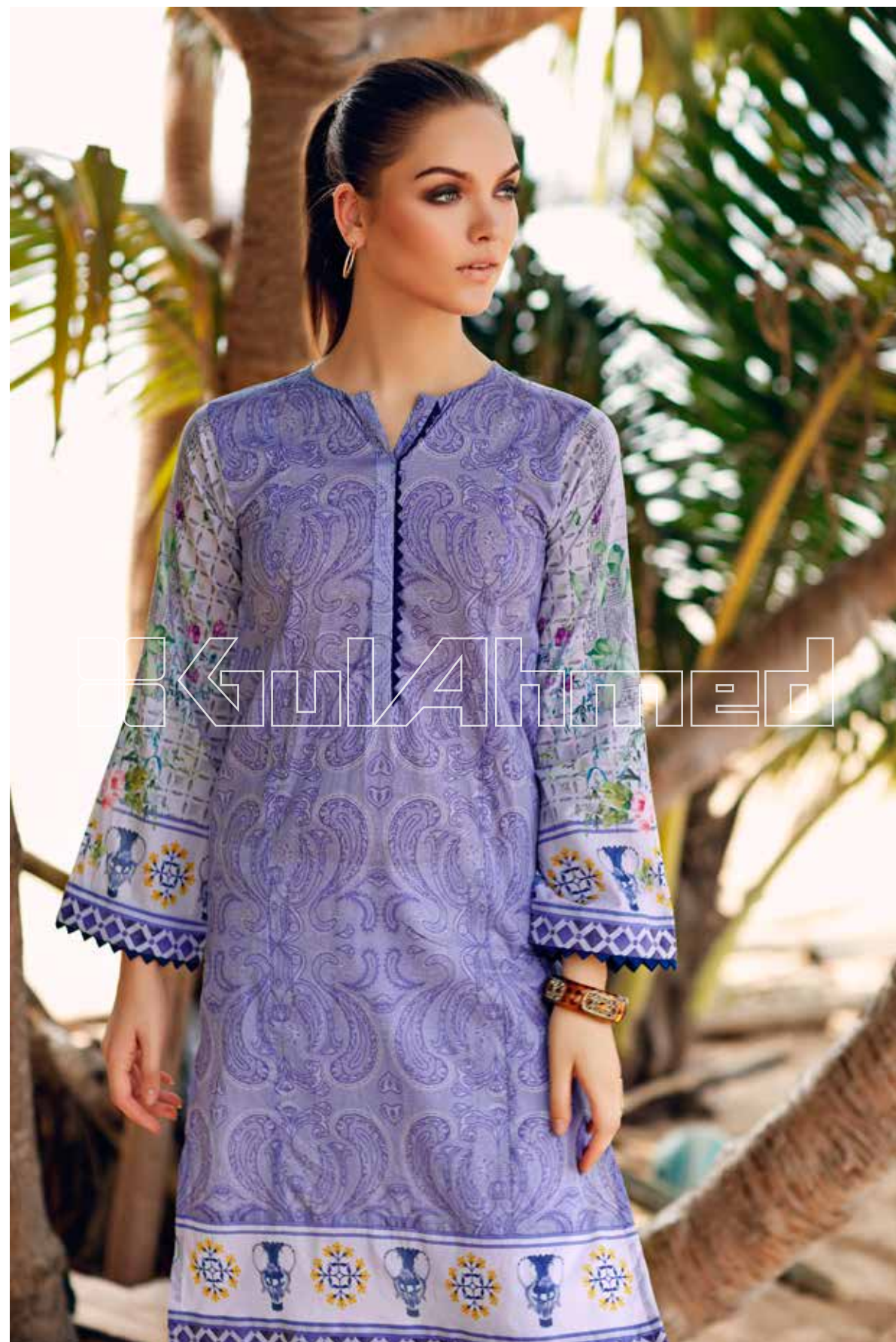
SL589 - DIGITAL PRINTED SHIRT