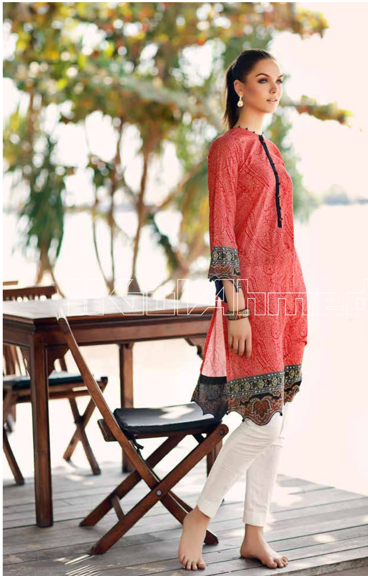
SL640 - DIGITAL PRINTED SHIRT