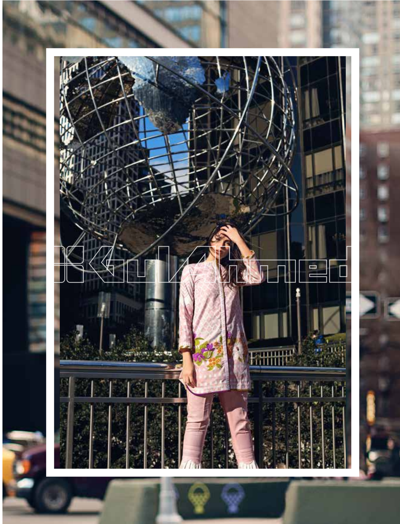
TL172B - PRINTED SHIRT WITH EMBROIDERED LACE & DYED BOTTOM