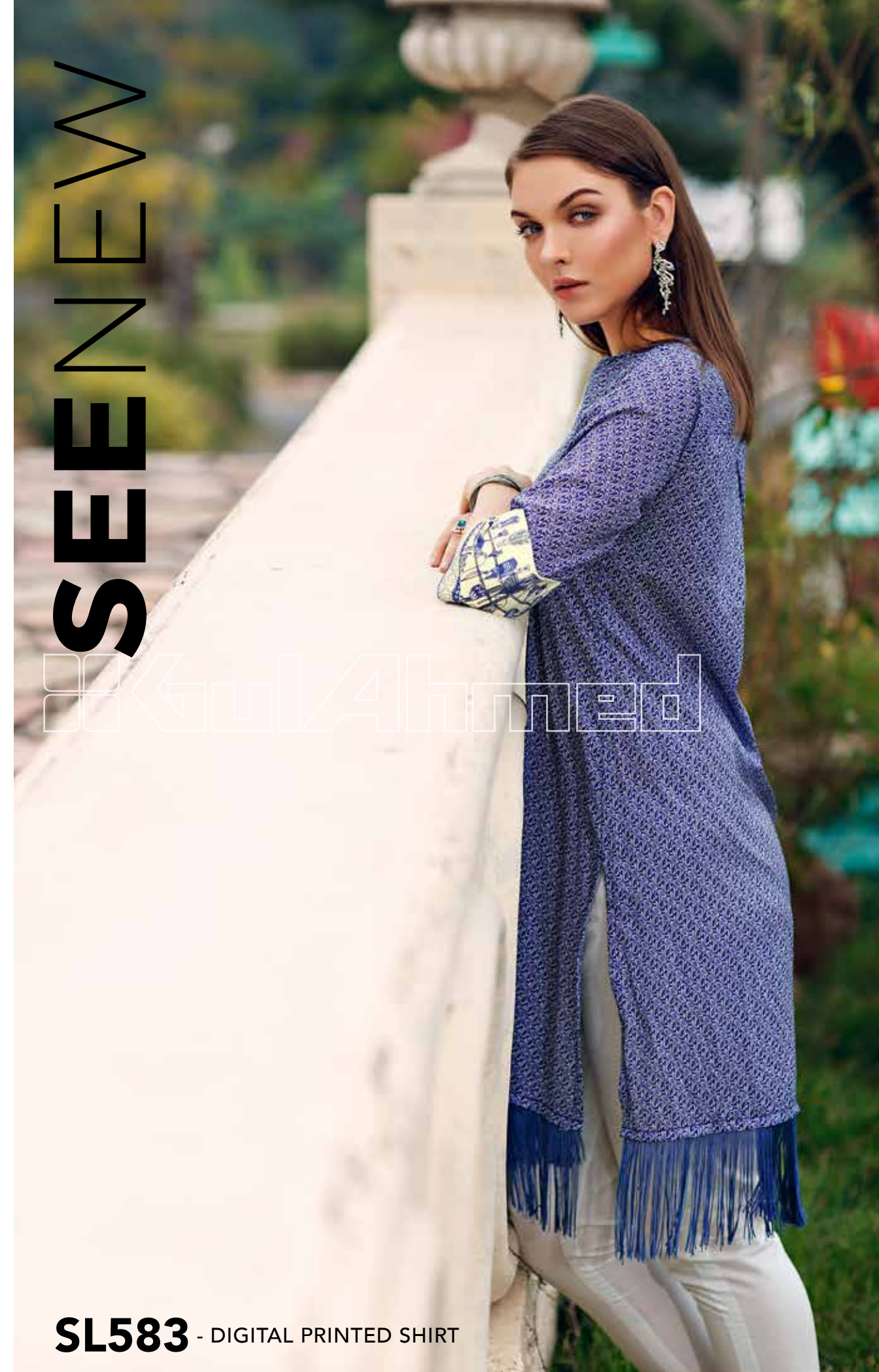
SL583 - DIGITAL PRINTED SHIRT