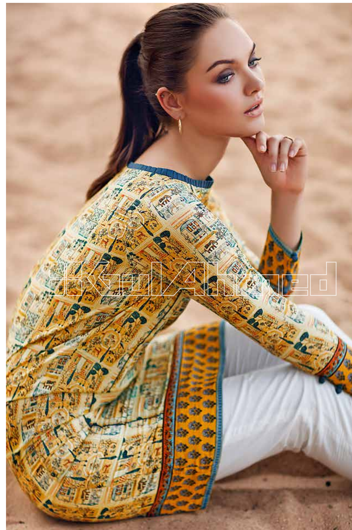
SL646 - DIGITAL PRINTED SHIRT