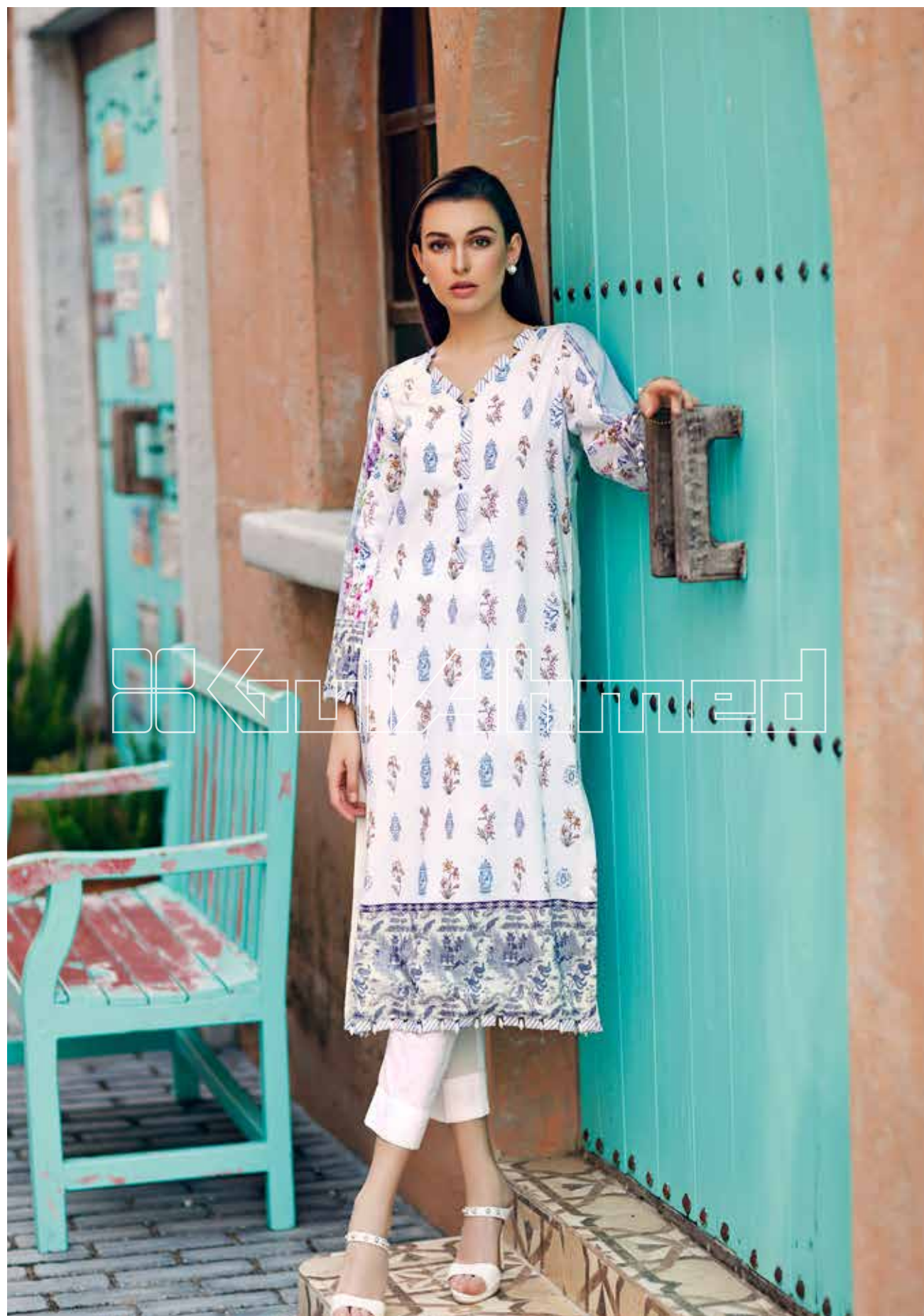
SL 617 - DIGITAL PRINTED SHIRT