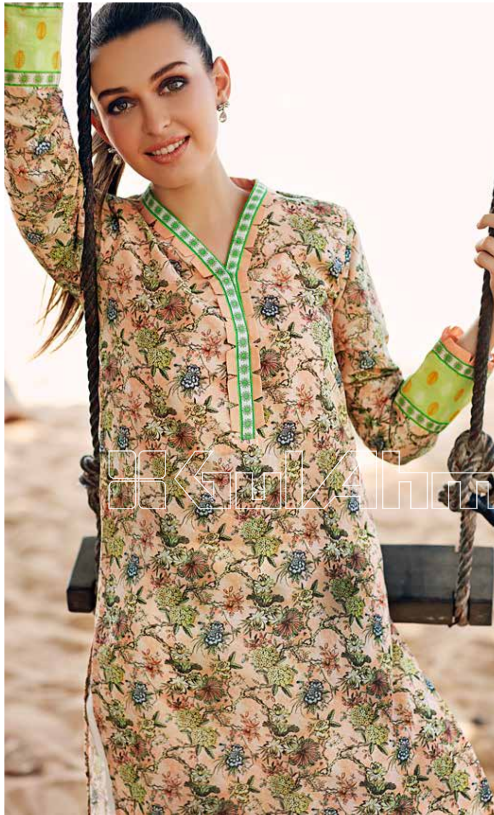
SL639 - DIGITAL PRINTED SHIRT