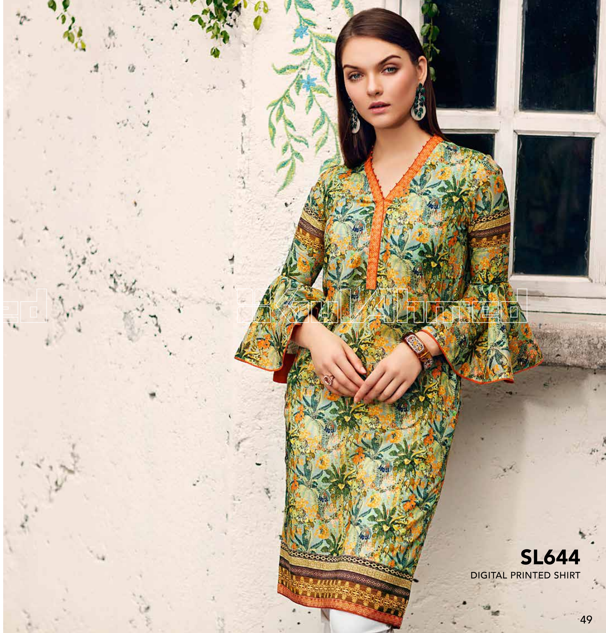
SL644 DIGITAL PRINTED SHIRT