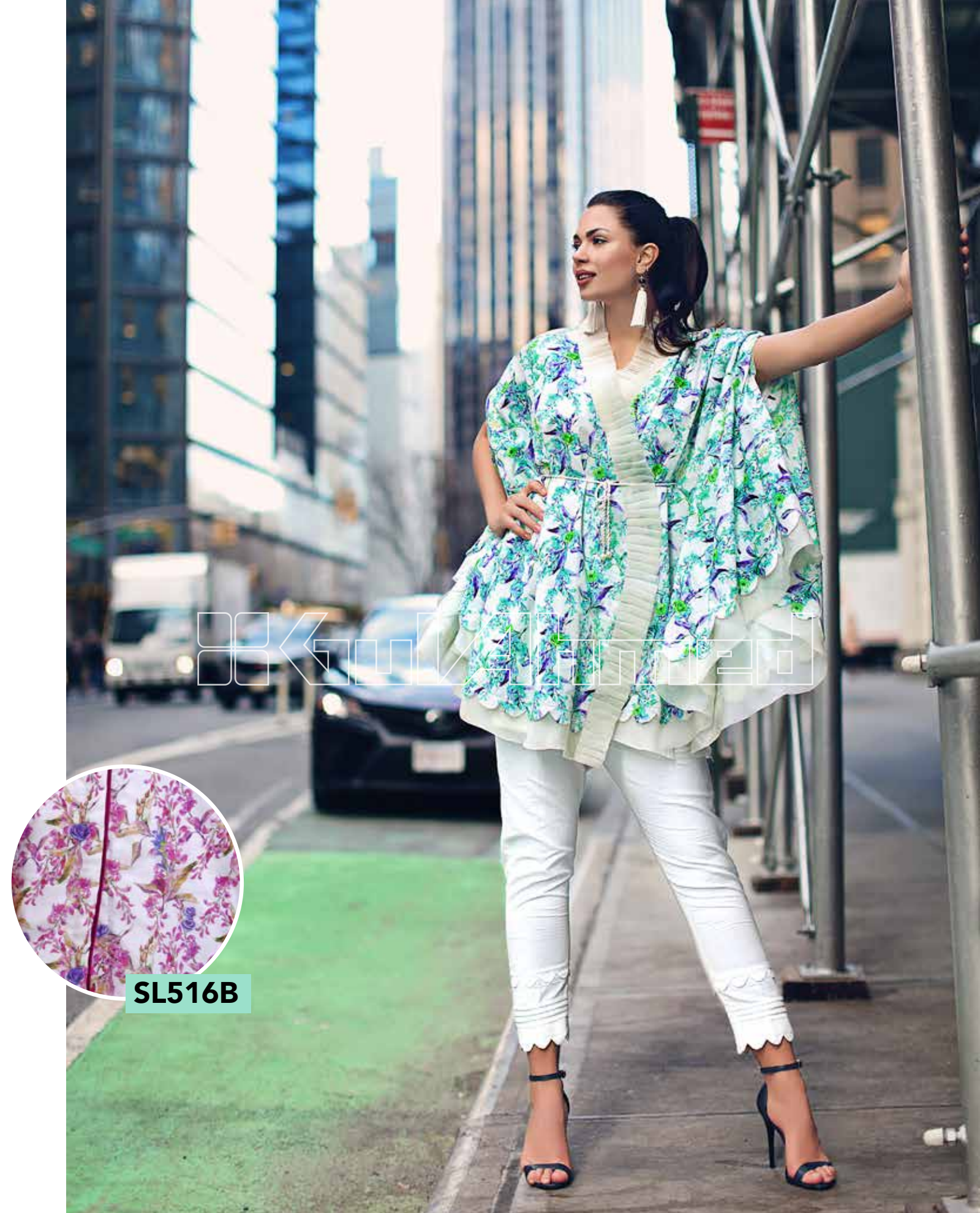
SL516A - DIGITAL PRINTED SHIRT