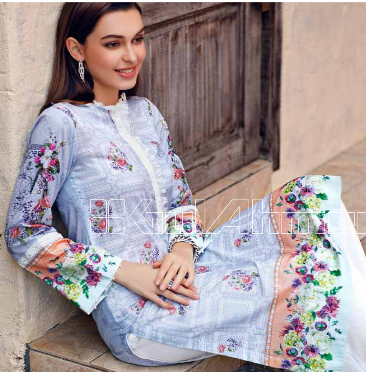
SL608 - DIGITAL PRINTED SHIRT