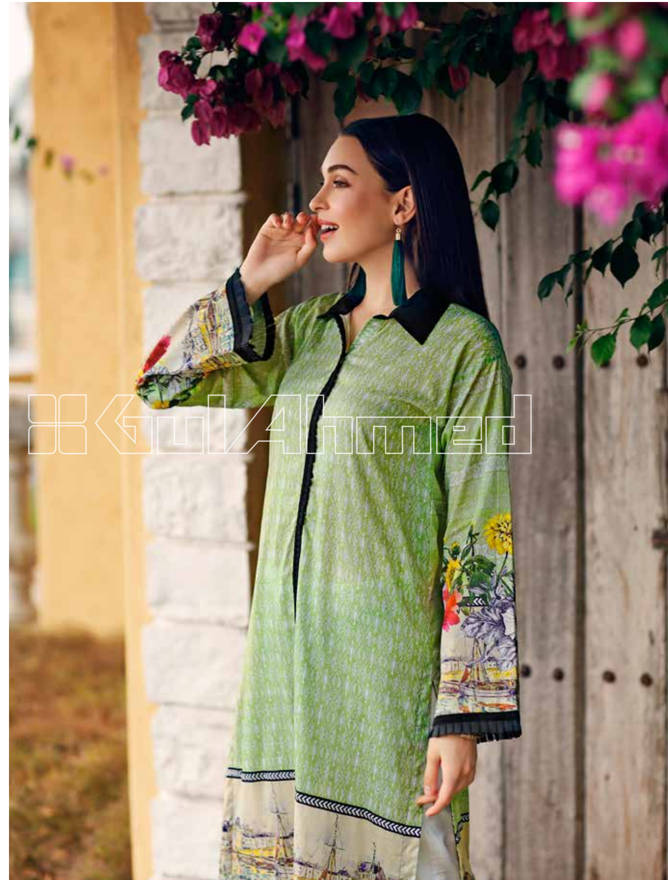
SL588 - DIGITAL PRINTED SHIRT