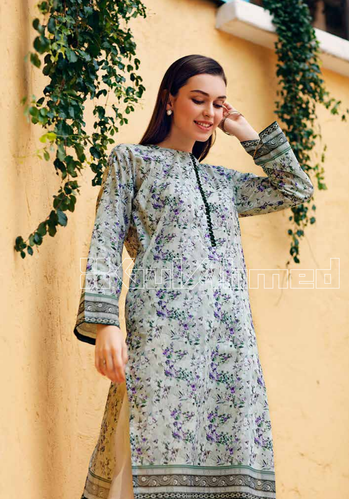
SL647 - DIGITAL PRINTED SHIRT