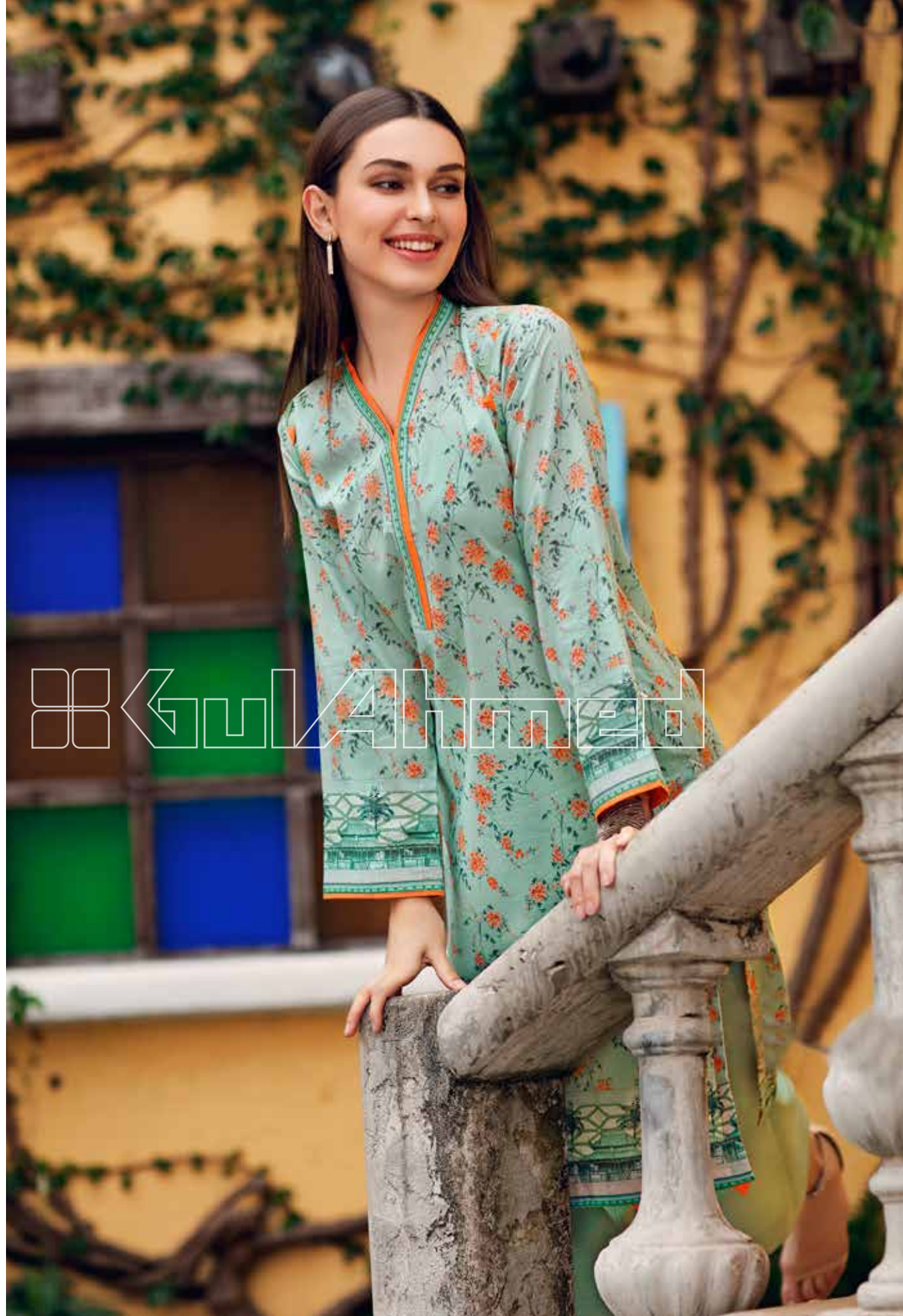
SL616 - DIGITAL PRINTED SHIRT