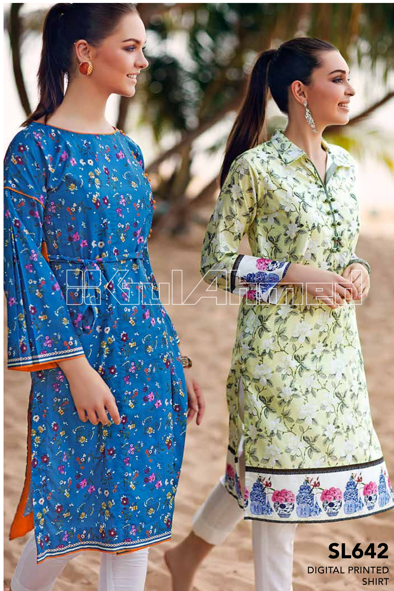
SL642 DIGITAL PRINTED SHIRT