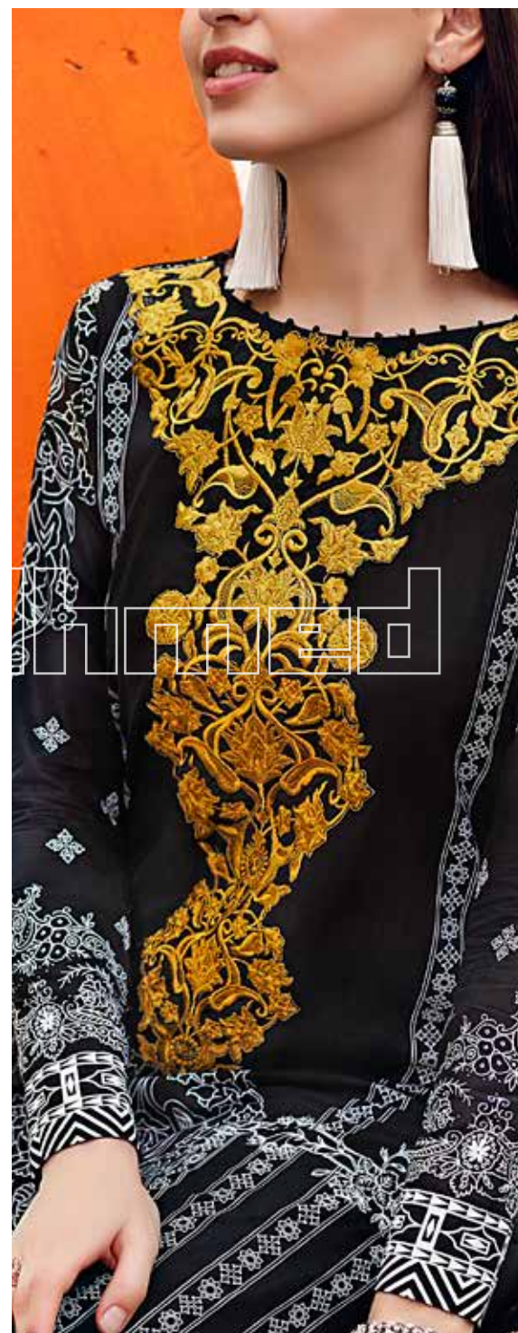
SL634 - LACQUER PRINTED SHIRT WITH EMBROIDERED NECKLINE