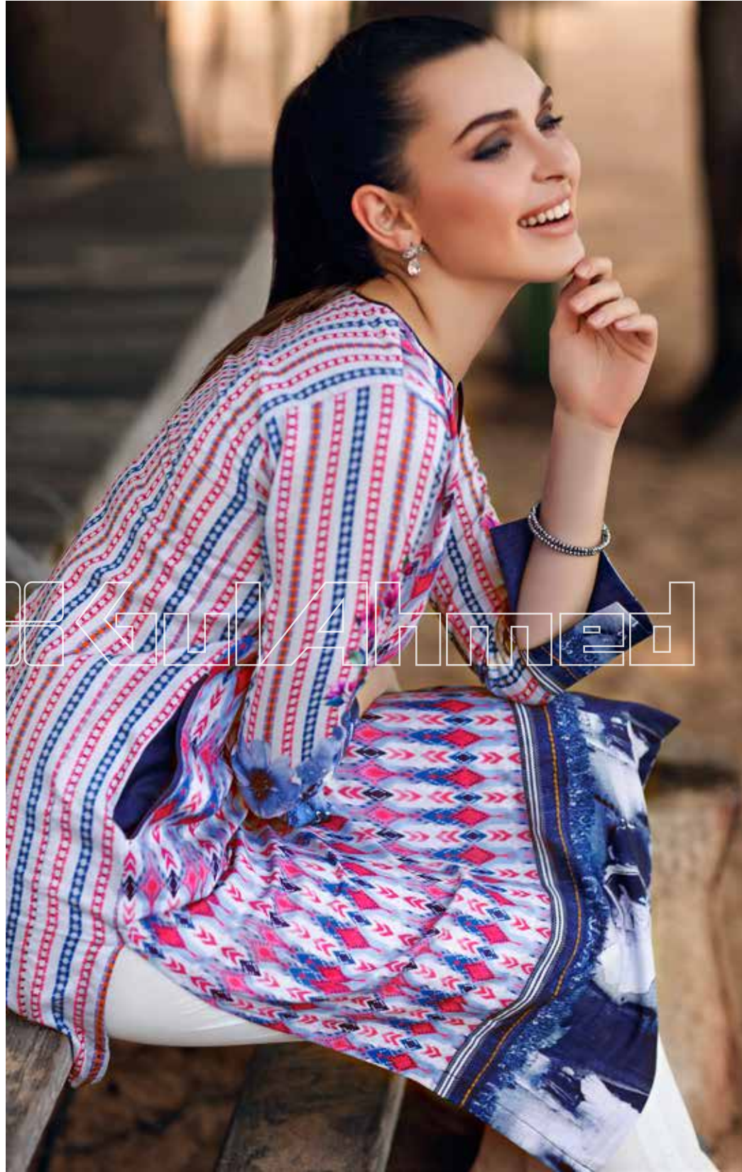
SL607 - DIGITAL PRINTED SHIRT