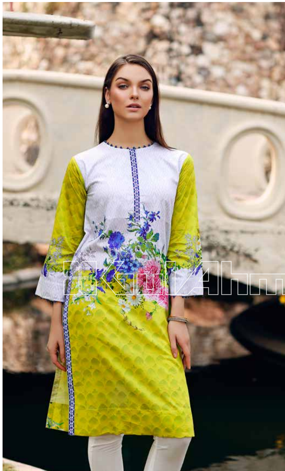
SL621 - DIGITAL PRINTED SHIRT