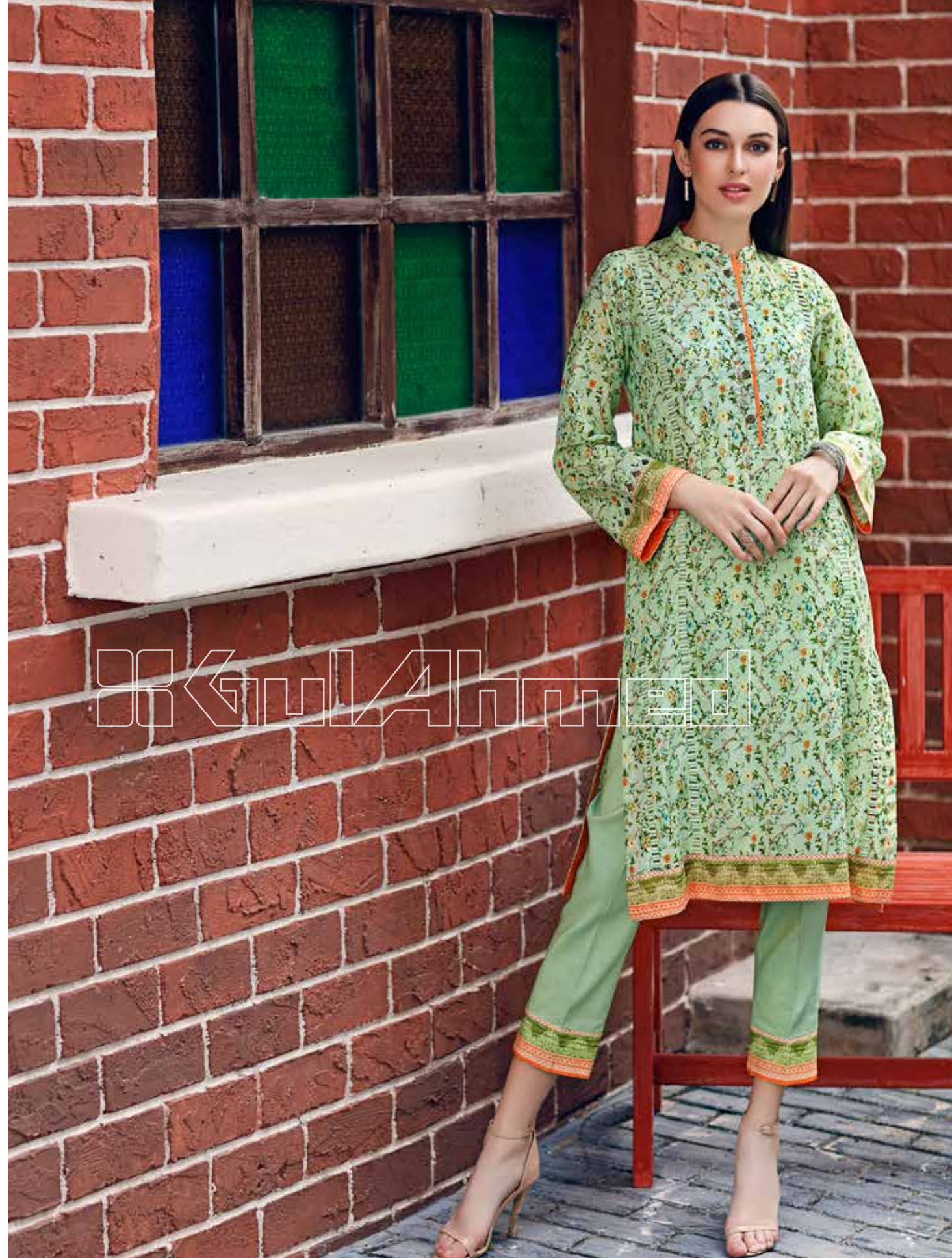
SL638 - DIGITAL PRINTED SHIRT