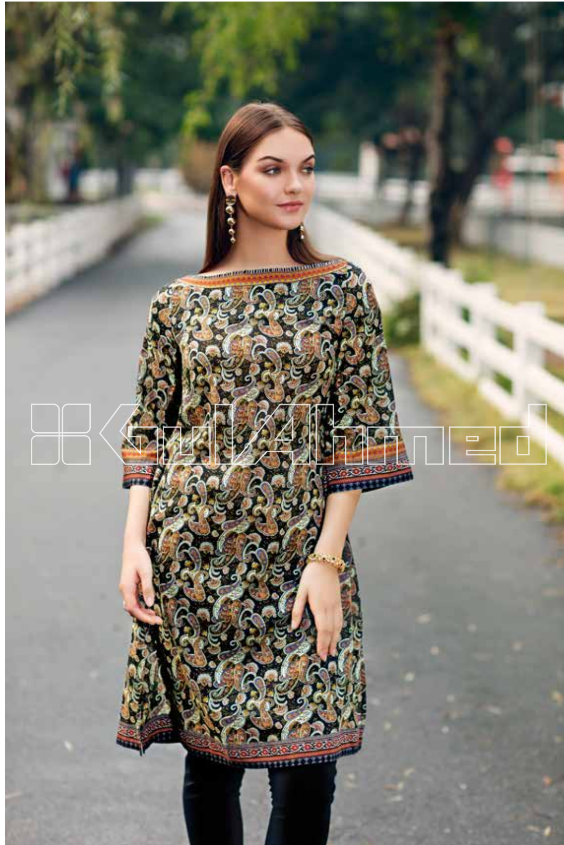
SL641 - DIGITAL PRINTED SHIRT