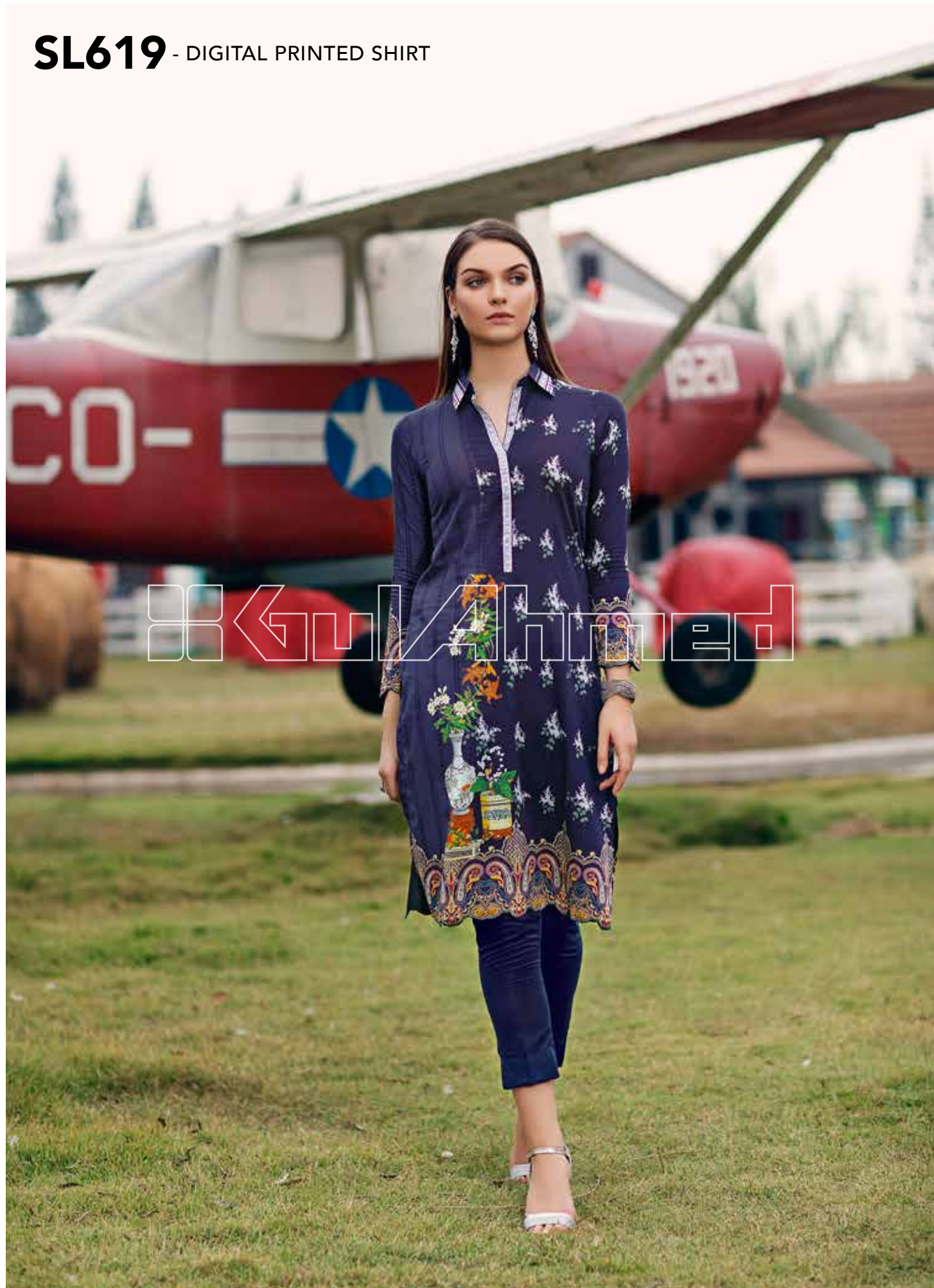
SL619 - DIGITAL PRINTED SHIRT