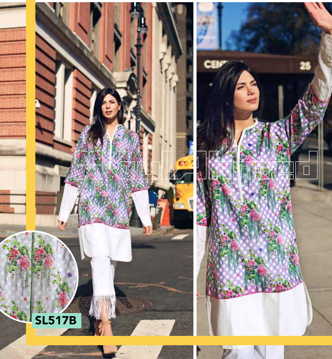
SL517A - DIGITAL PRINTED SHIRT