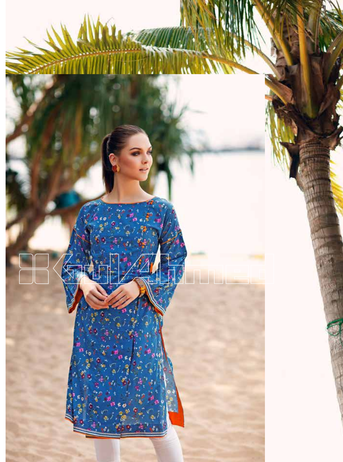
SL615 - DIGITAL PRINTED SHIRT