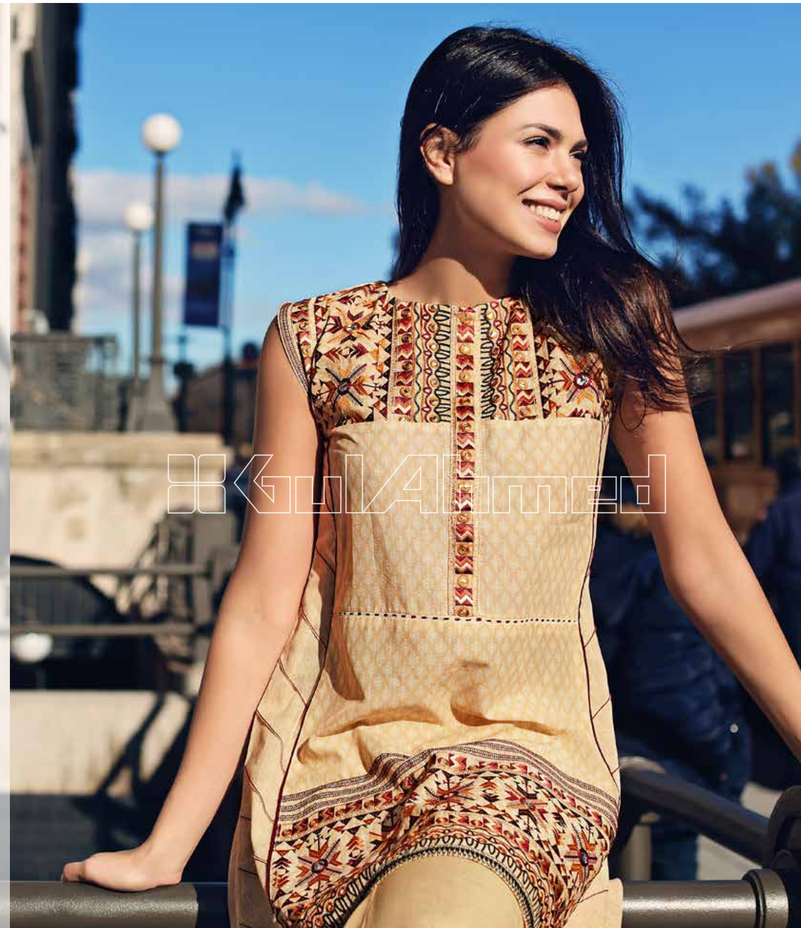
TL173A - PRINTED SHIRT WITH EMBROIDERED SLEEVES, LACE & DYED BOTTOM