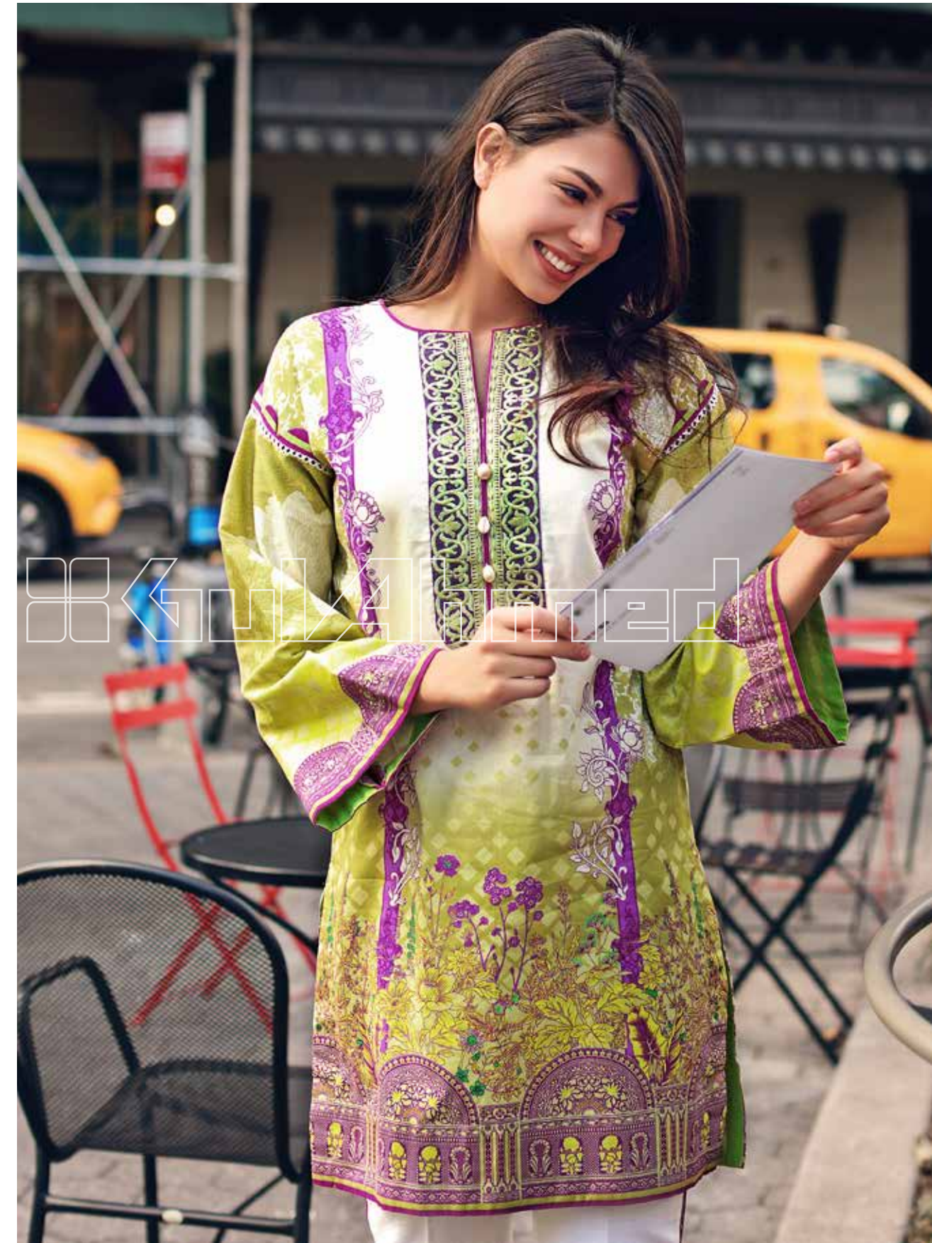
SL509 - PRINTED SHIRT WITH EMBROIDERED LACE