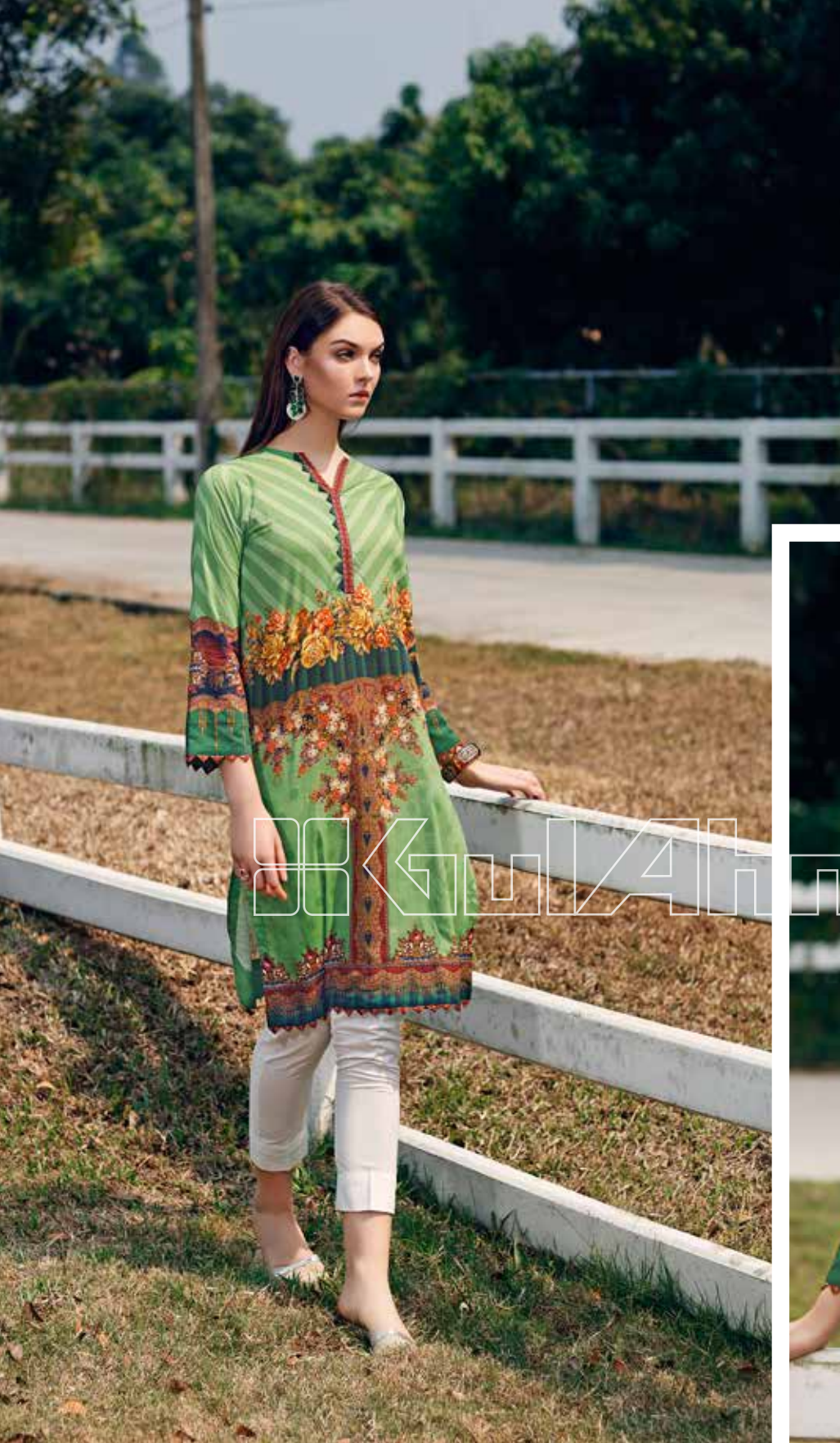
SL620 - DIGITAL PRINTED SHIRT