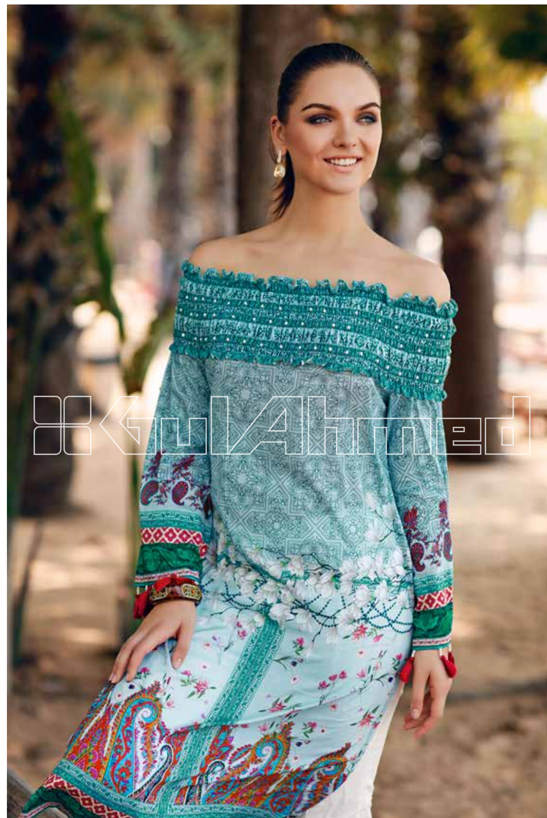
SL618 - DIGITAL PRINTED SHIRT