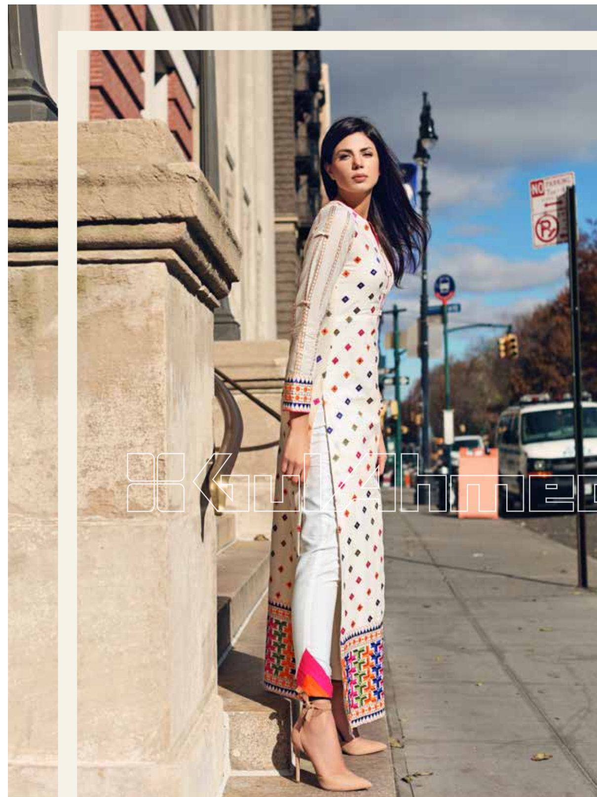
SL512 - EMBROIDERED SHIRT

Also Available as stitched at selected ideas stores & online.