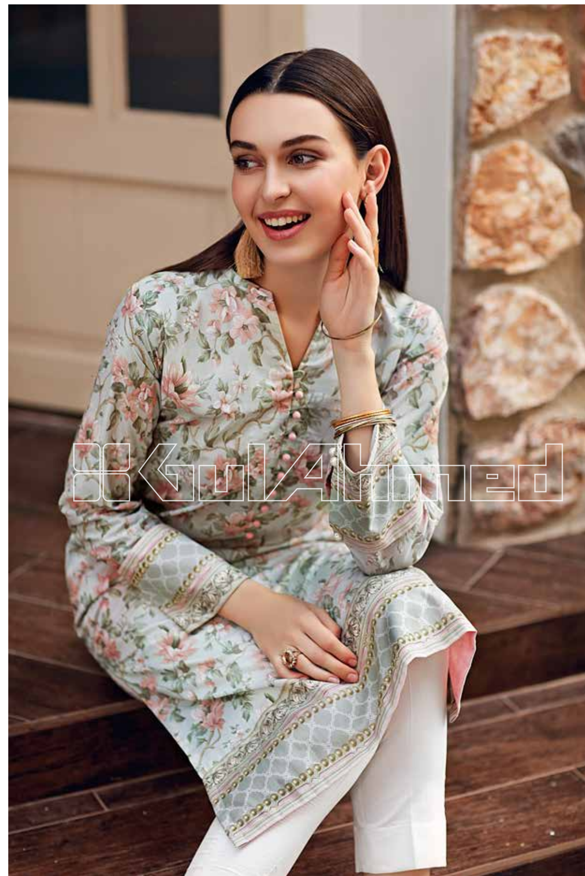
SL631 - DIGITAL PRINTED SHIRT