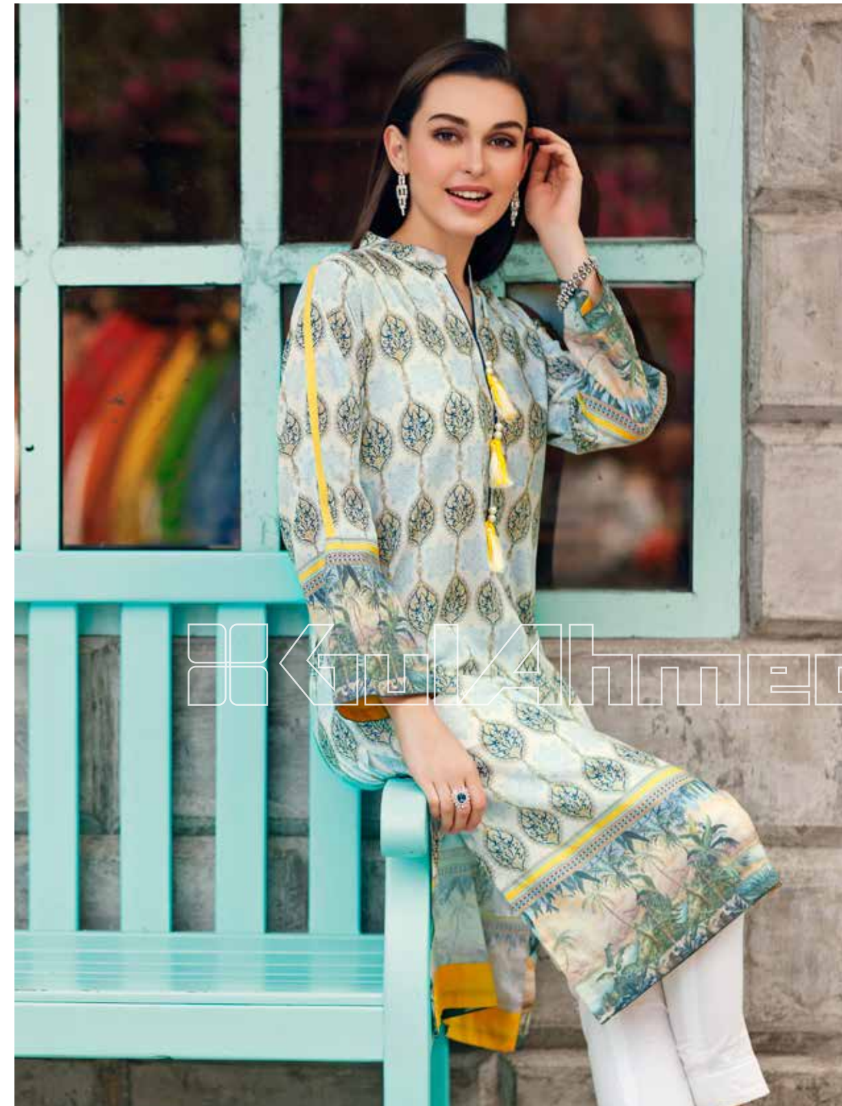
SL585 - DIGITAL PRINTED SHIRT