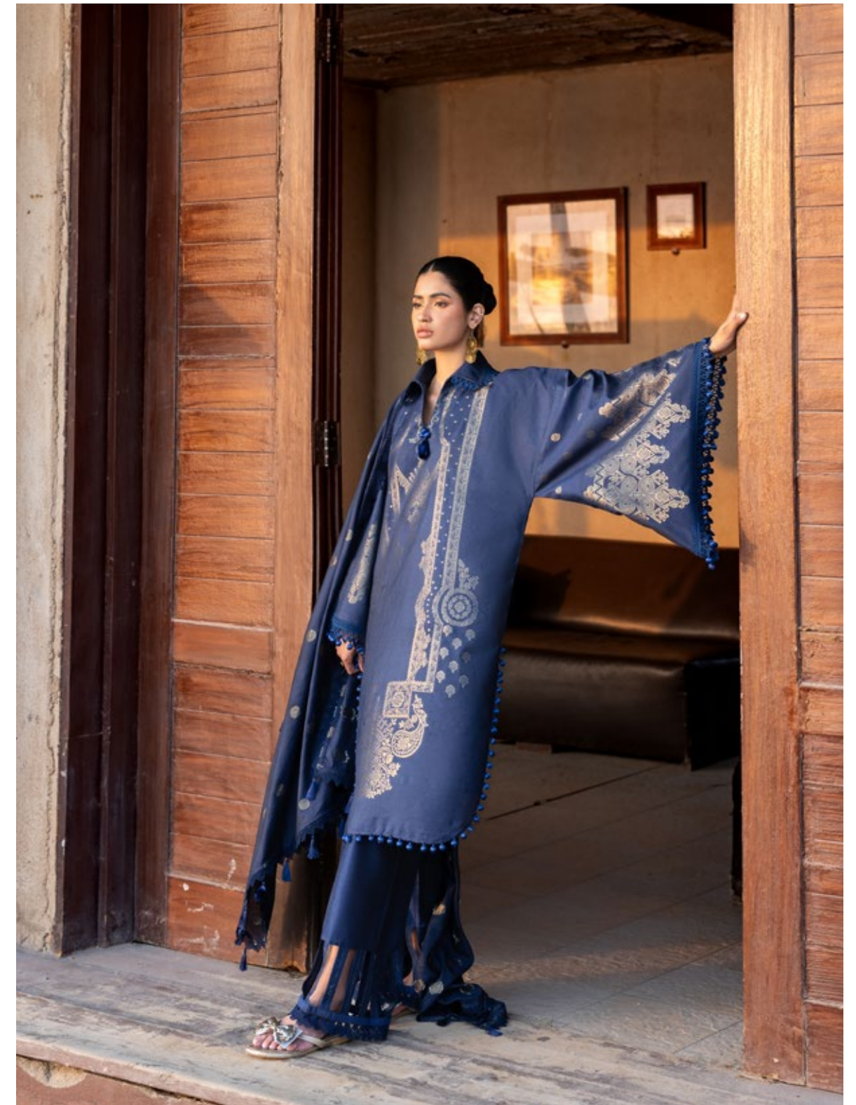
Jacquard Dupatta. Jacquard Shirt. Dyed Inner & Trouser.