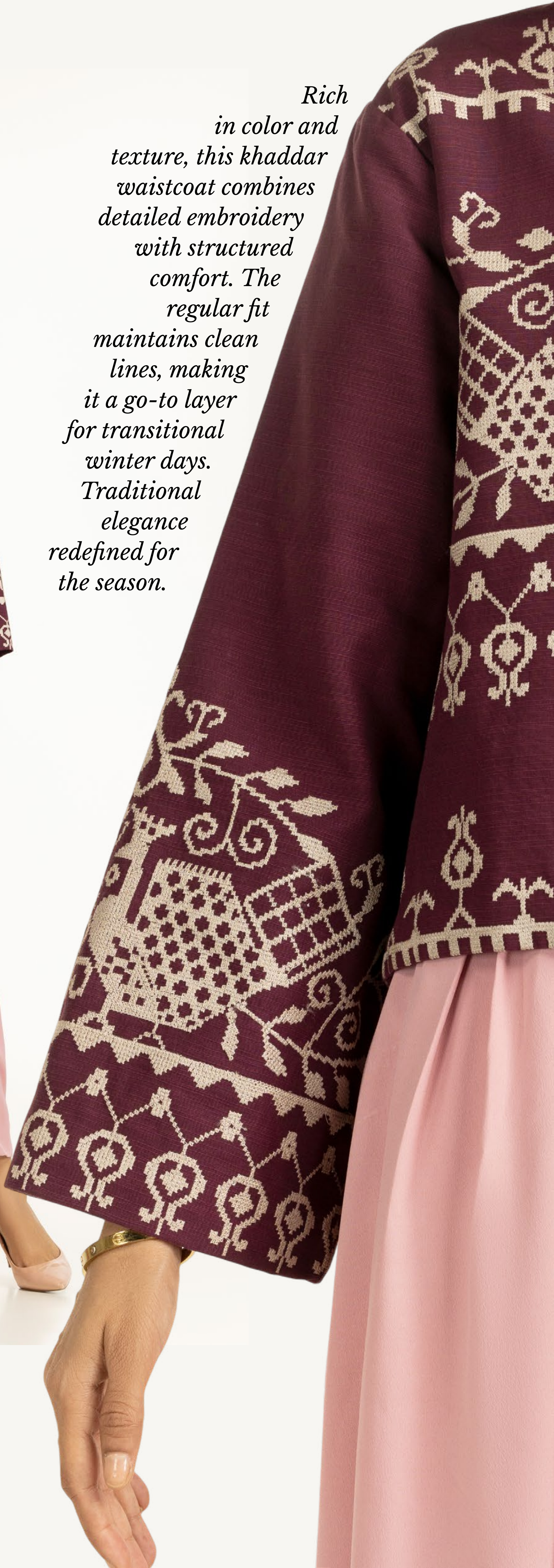
Khaddar Embroidered Waistcoat IPS-5521O