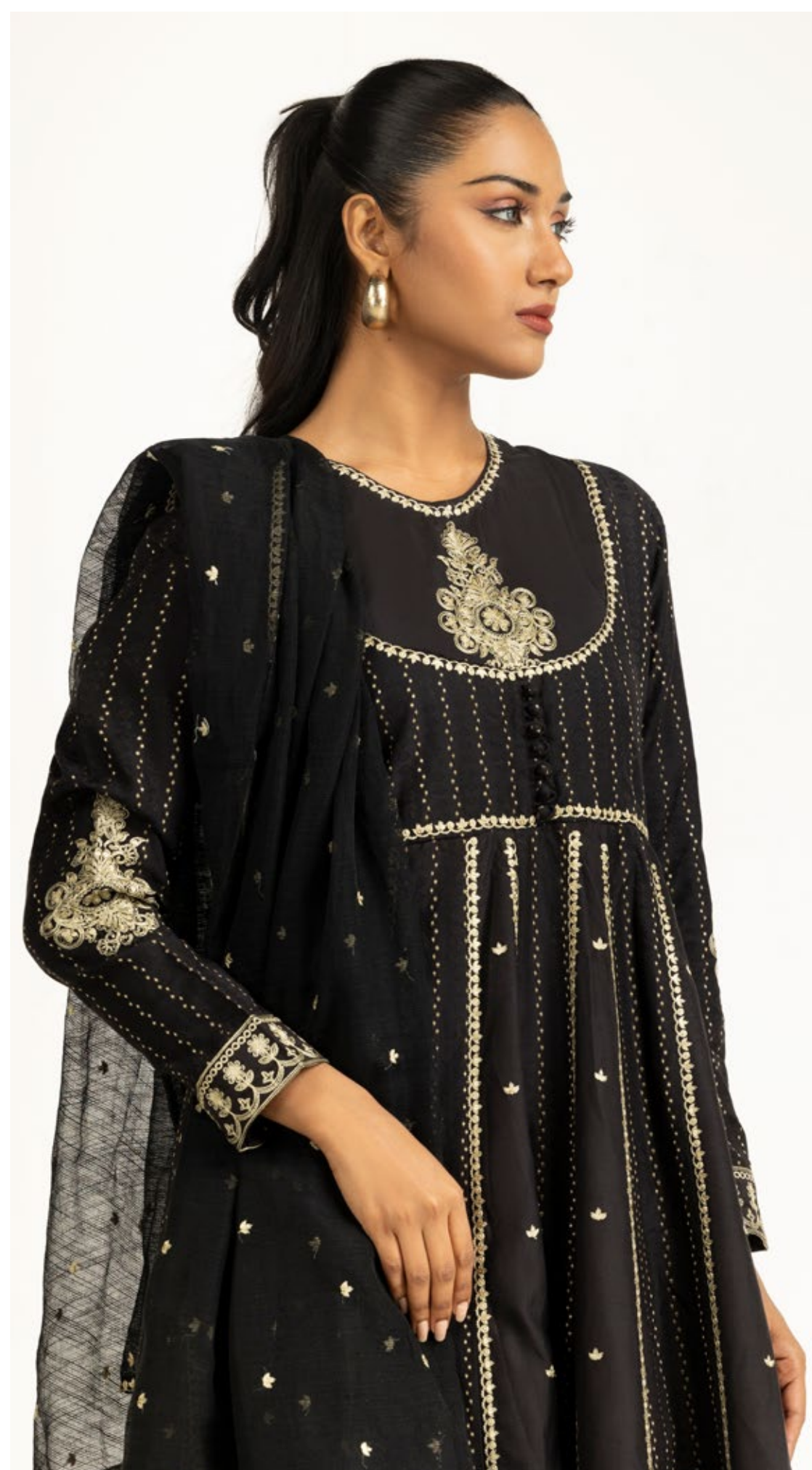
3PC Denier Jacquard Embroidered Suit IPSTD-44447