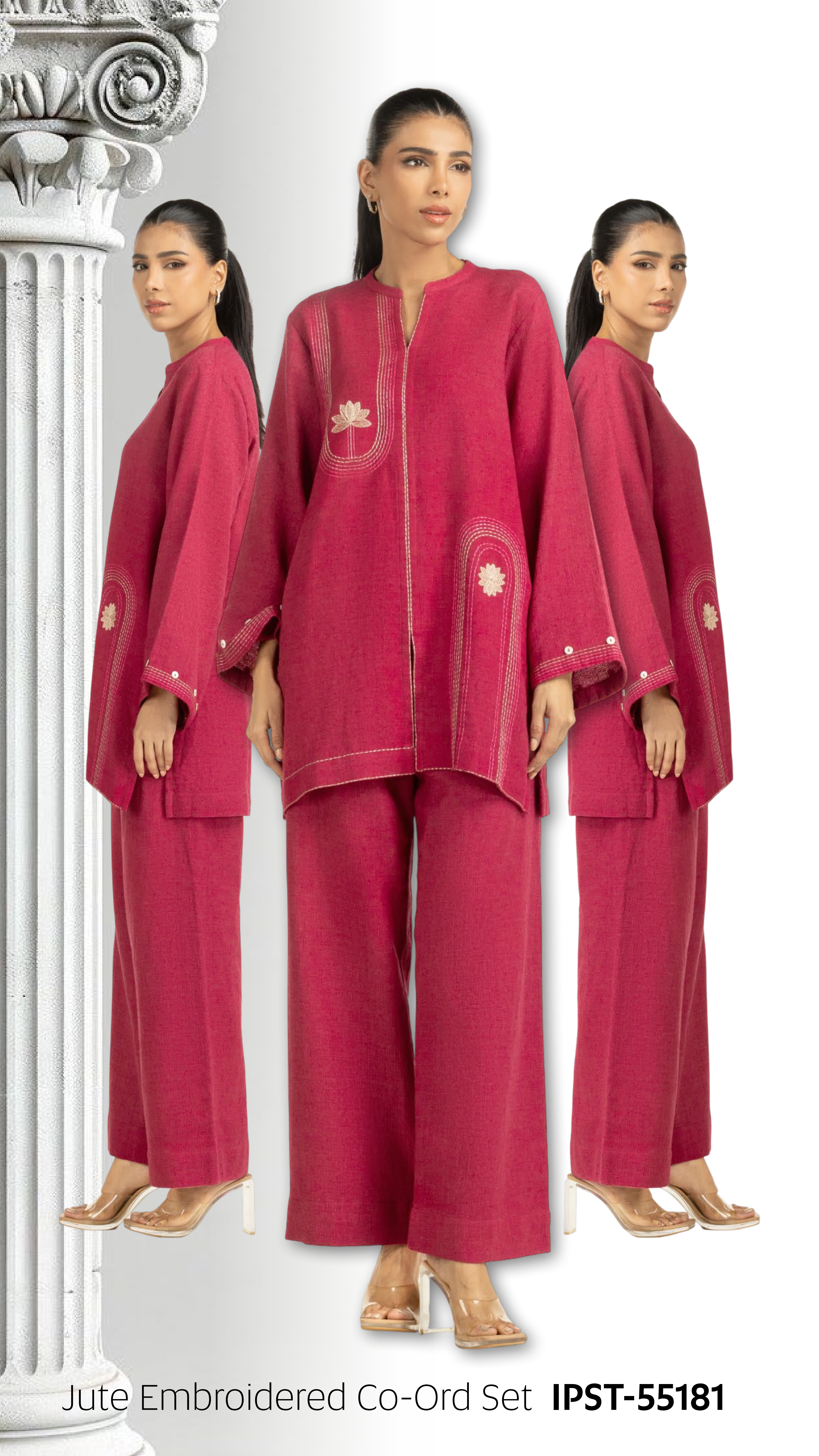
Jute Embroidered Co-Ord Set IPST-55181