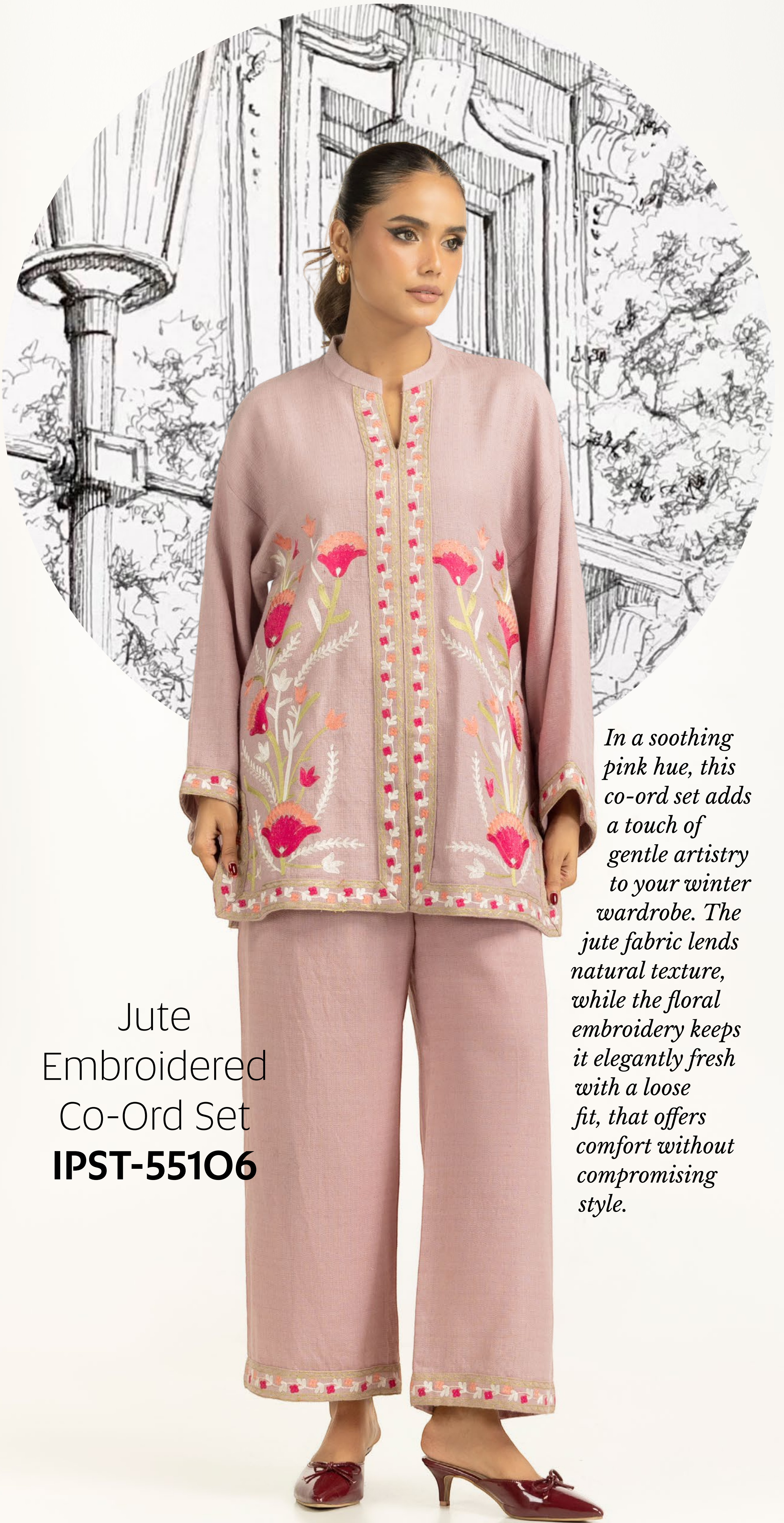
Jute Embroidered Co-Ord Set IPST-55106

In a soothing pink hue, this co-ord set adds a touch of gentle artistry to your winter wardrobe. The jute fabric lends natural texture, while the floral embroidery keeps it elegantly fresh with a loose fit, that offers comfort without compromising style.