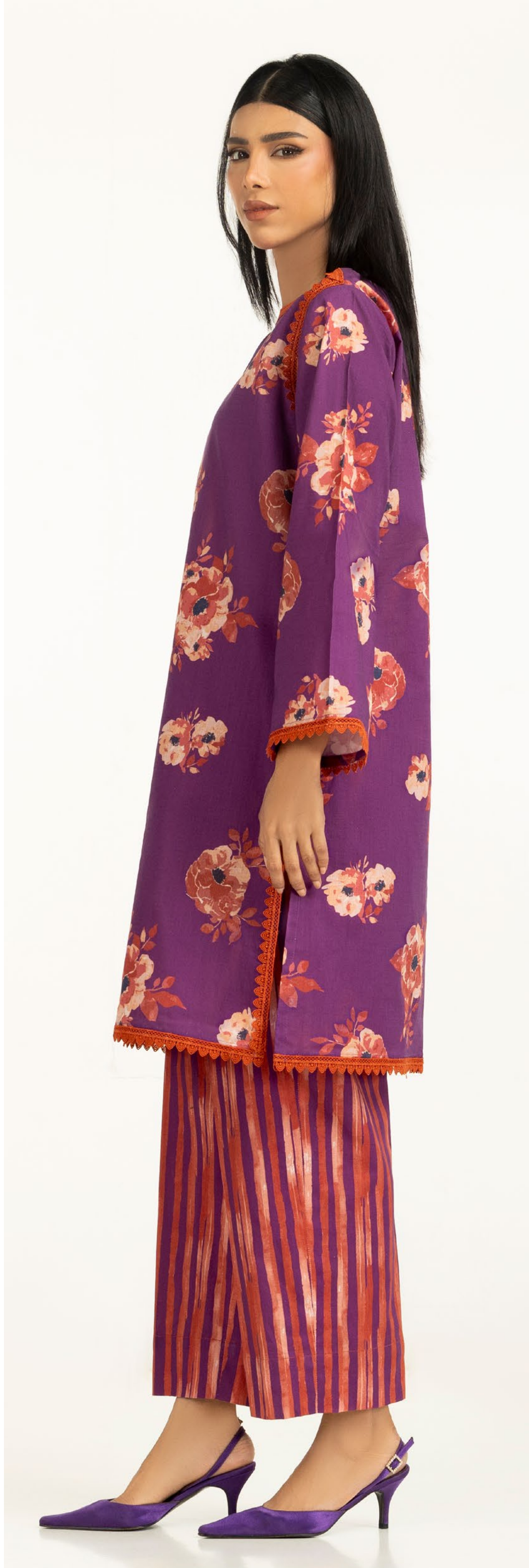
CROSS SLUB PRINTED CO-ORD SET IPST-55121

A fusion of pattern and texture, this co-ord set pairs a beautiful floral print with striped trousers for a smart look. The cross slub fabric offers warmth with light structure, perfect for cozy winter styling. While its loose fit keeps it easy and breathable all day.