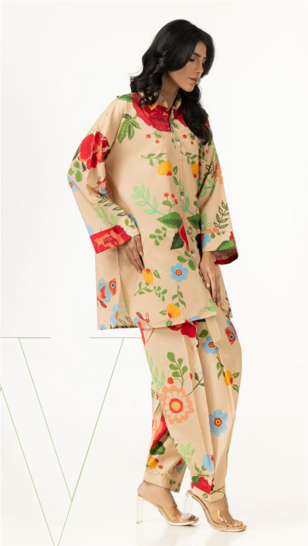
PRINTED CO-ORD SET IPST-55282