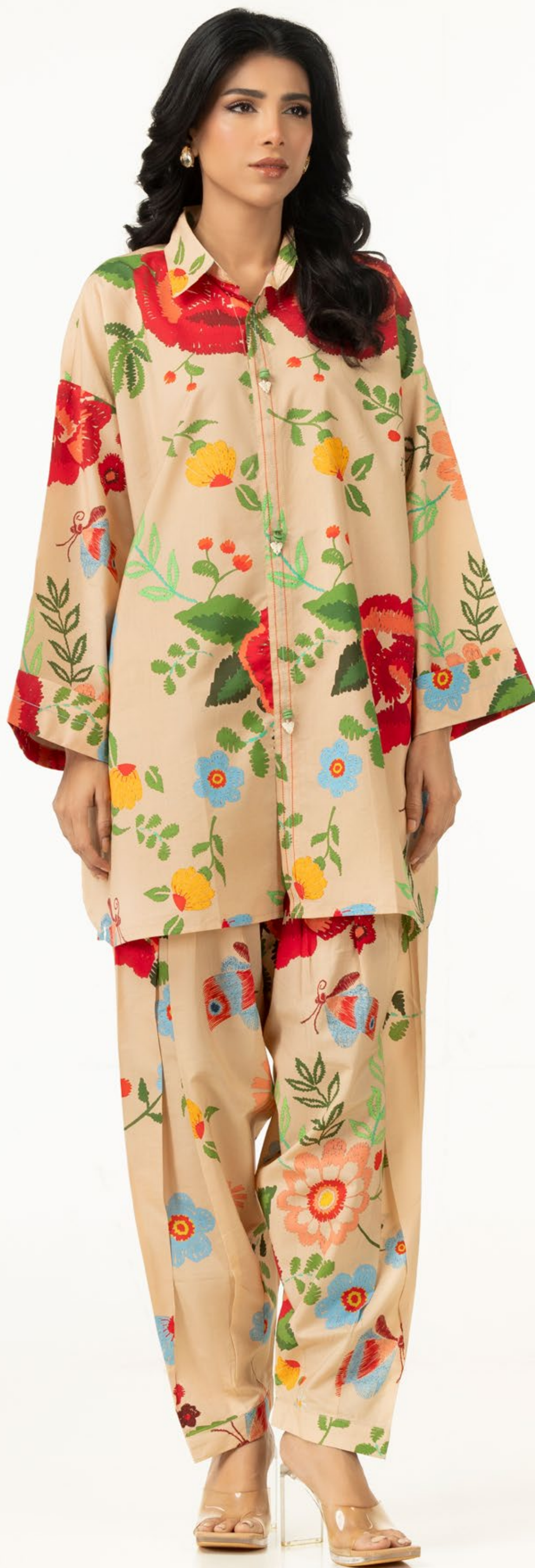
PRINTED CO-ORD SET IPST-55282

This modern two-piece set features a cream shirt with a collar neck and bold, bright floral prints. The shirt center includes a unique decorative detail finished with small buttons. The coordinating trousers feature contemporary pleats at the hem for a sharp, modern silhouette.