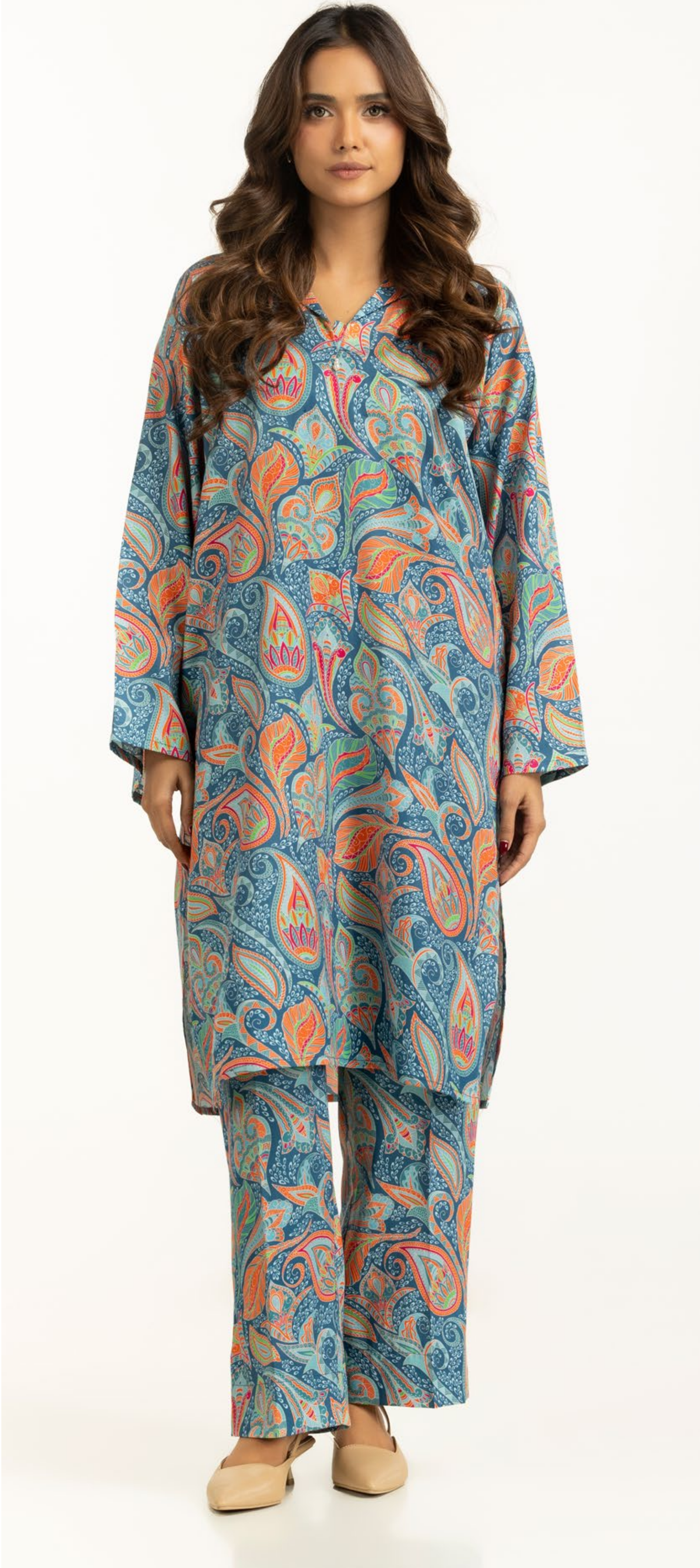
TENCIL VISCOSE PRINTED CO-ORD SET IPST-55058