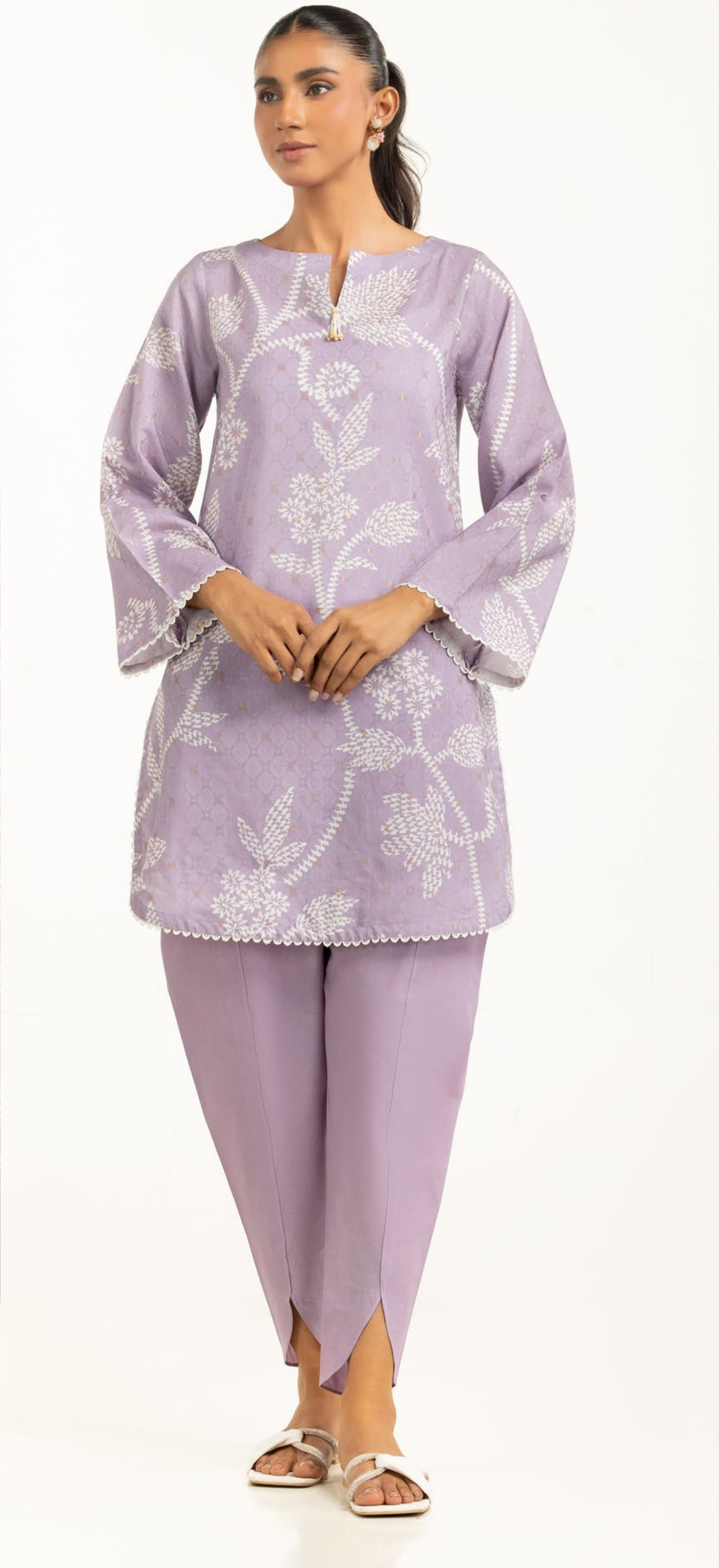
DENIER JACQUARD PRINTED CO-ORD SET IPST-55264-A