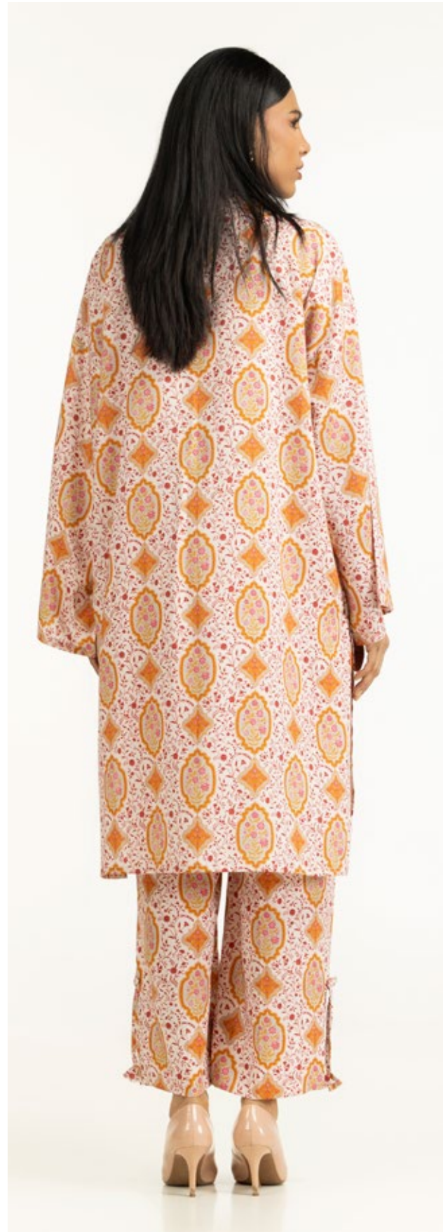
VISCOSE PRINTED CO-ORD SET IPST-55334