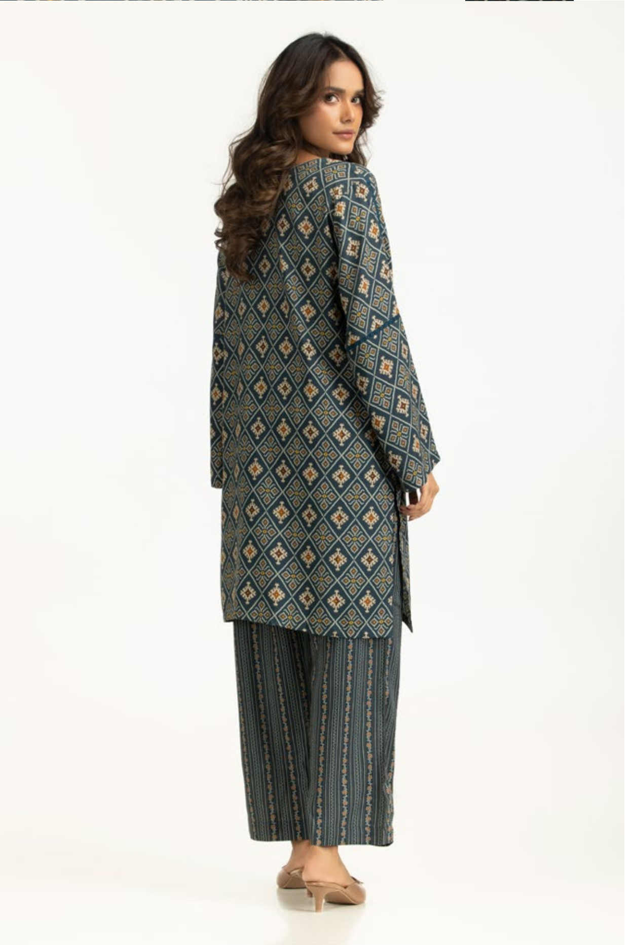
VISCOSE PRINTED CO-ORD SET IPST-55022