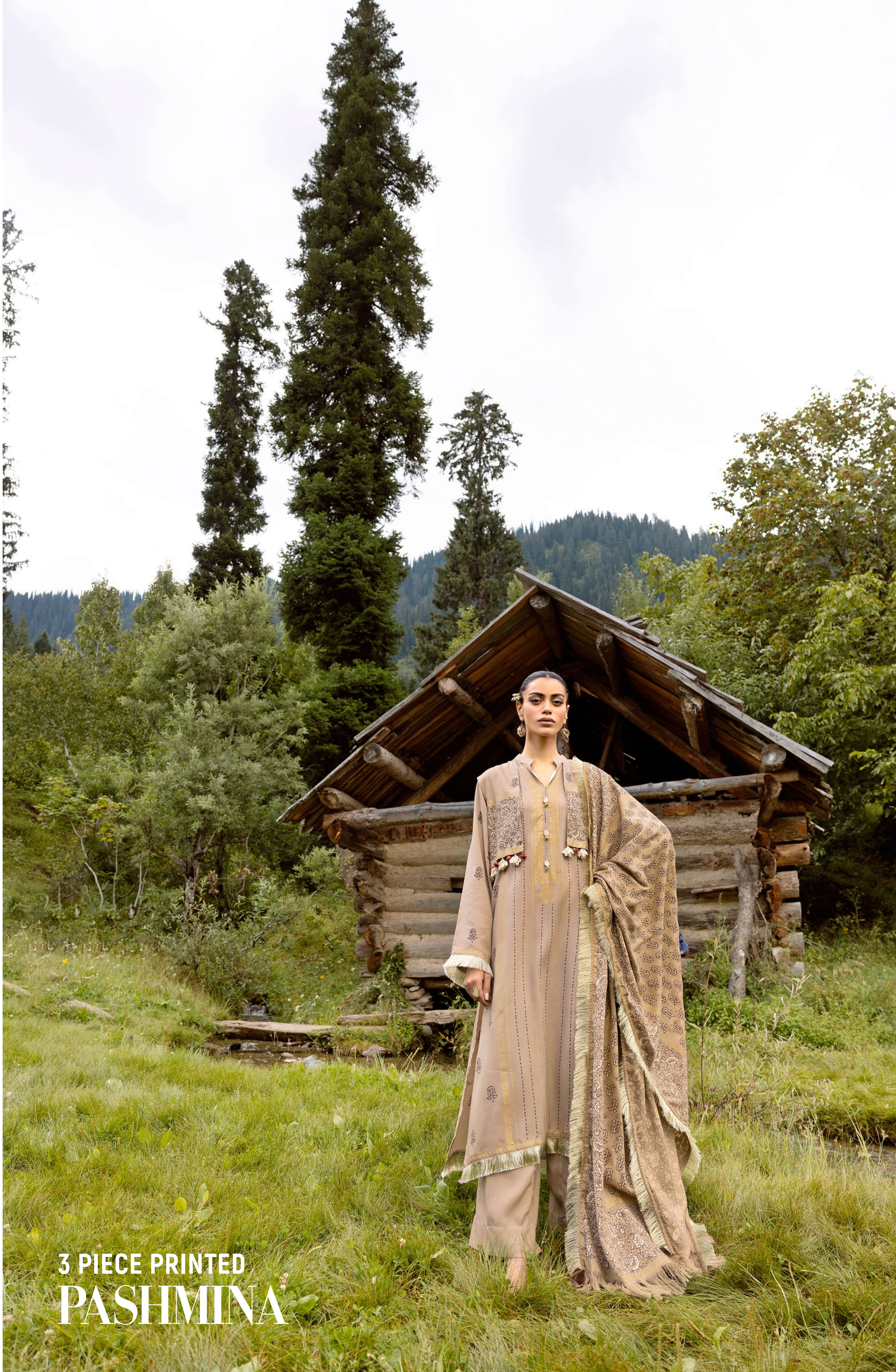
3 PIECE PRINTED PASHMINA