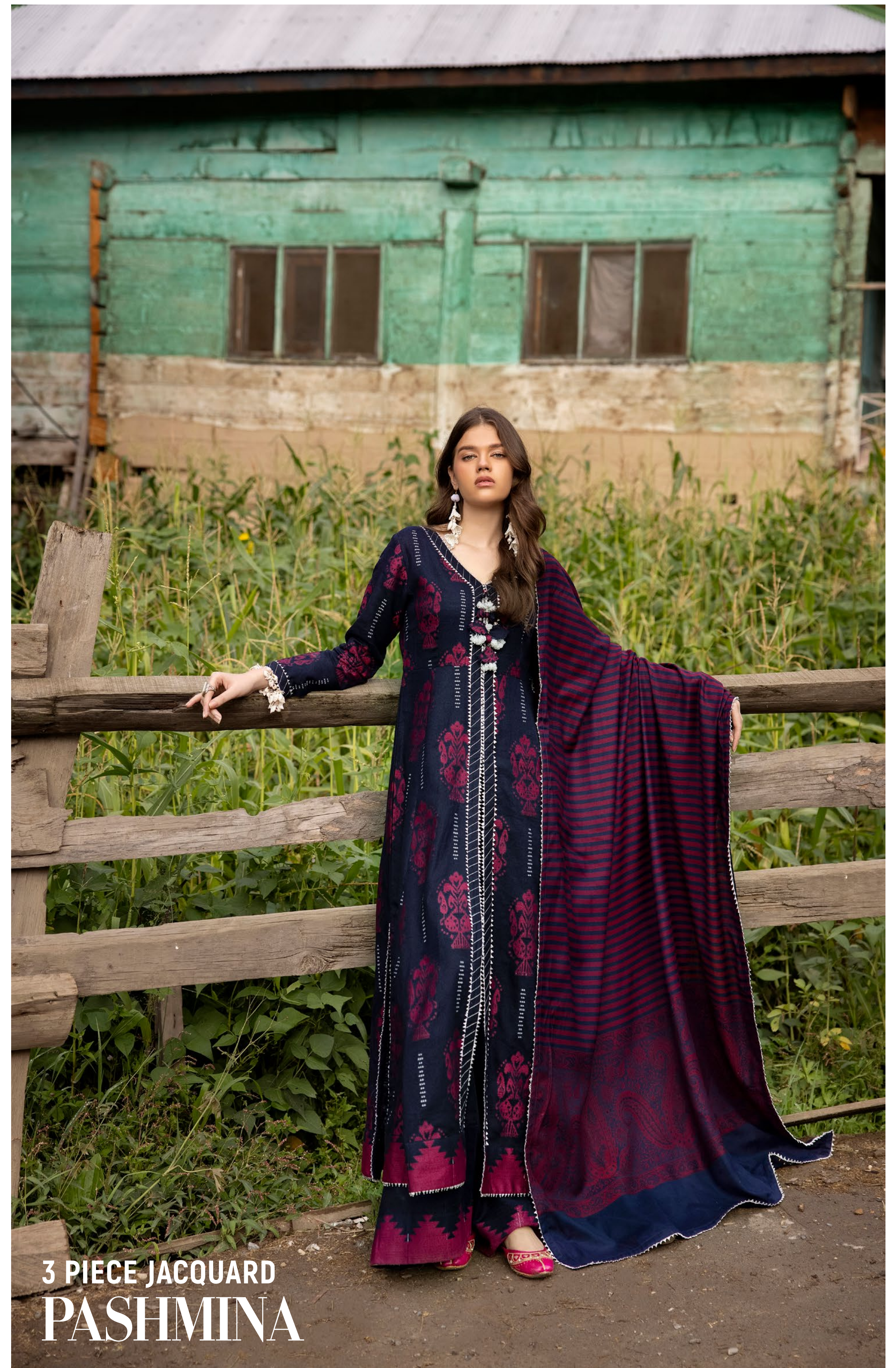
3 PIECE JACQUARD PASHMINA